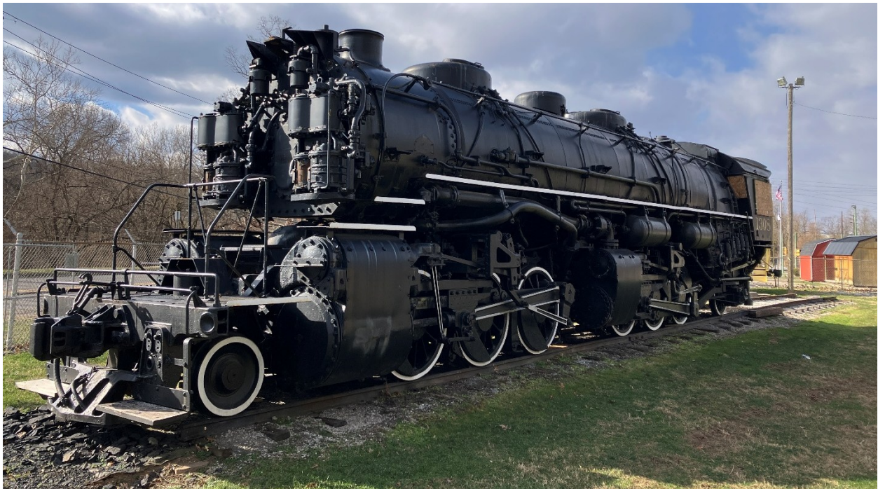
Figure 2 Locomotive 1308 at its present location in the Collis P. Huntington Railroad Historical Society Museum. The attached coal tender was moved to the Age of Steam Museum in October 2025.