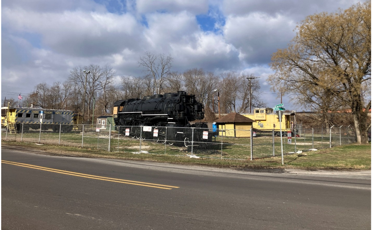
Figure 1 Locomotive 1308 at its present location in the Collis P. Huntington Railroad Historical Society Museum, 14th St. W. and Memorial Blvd., Huntington, Cabell Co., WV