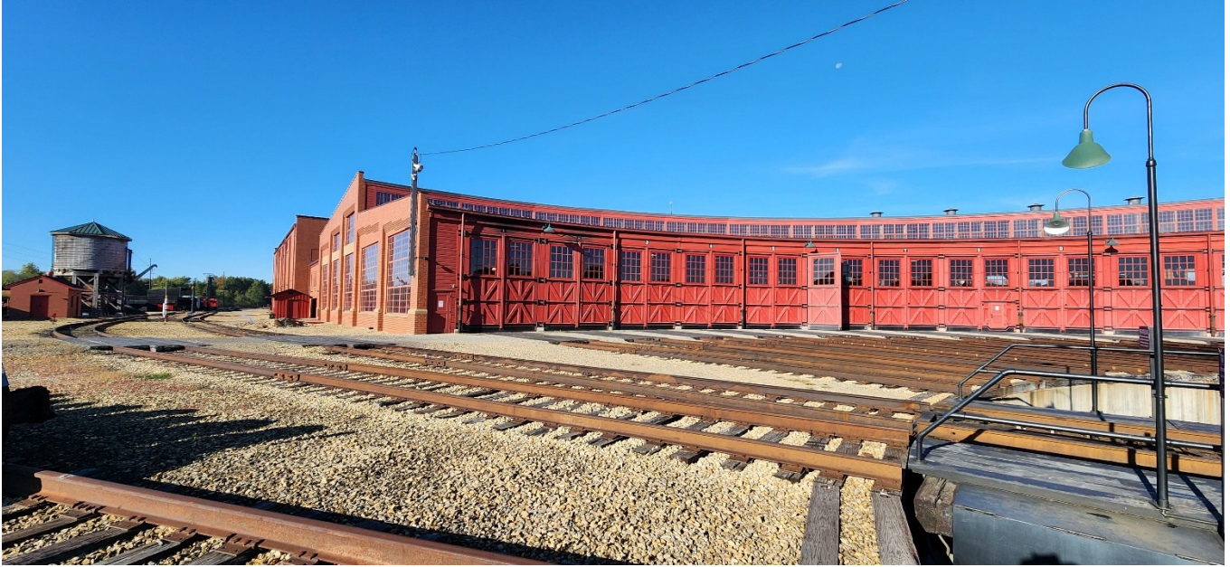
Figure 4 Section of the roundhouse where Locomotive 1308 will be located