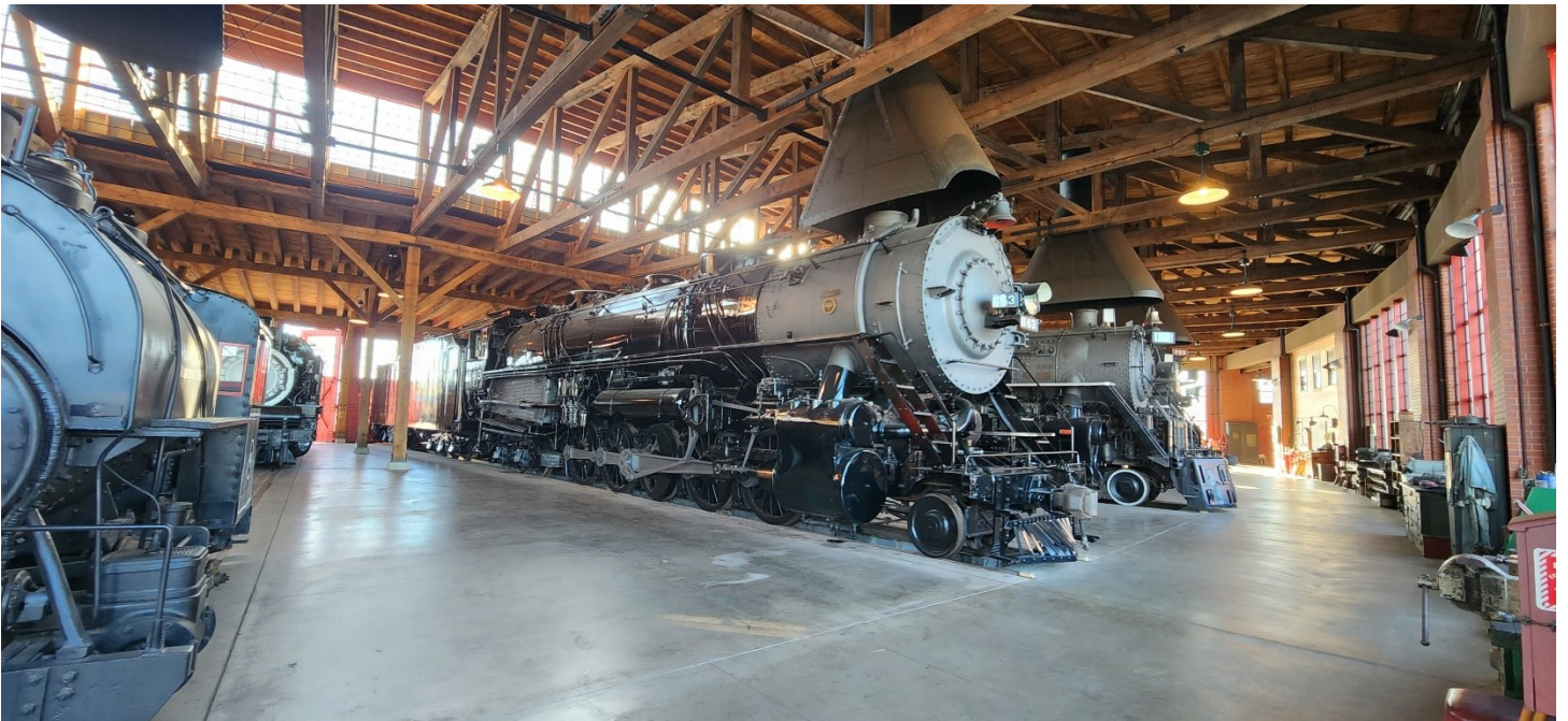
Figure 5 Locomotives on display inside the roundhouse. This is how Locomotive 1308 will be stored and what its immediate surroundings will look like.