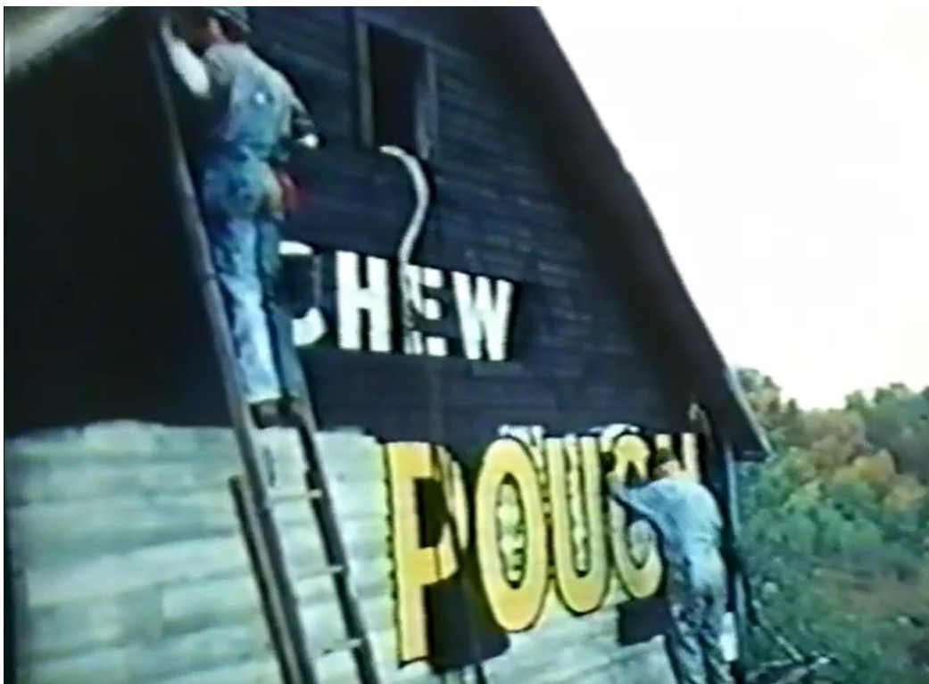
Figure 5 Retired painter Maurice Zimmerman and a helper demonstrated Mail Pouch Sign painting in the 1977 documentary "Zim."