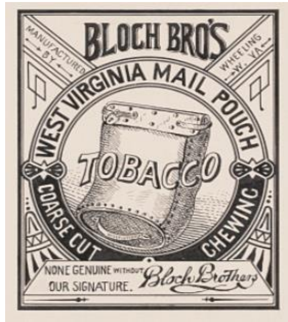
Figure 1 Mail Pouch Logo Trademark 1900.

Thanks to the Bloch Brothers' successful sales tactics, Mail Pouch became one of the most popular chewing tobacco brands in the American Midwest, the Ohio Valley, and parts of the Northeast. In a nod to its Wheeling origins and strong taste, the tobacco was colloquially referred to as "West Virginia coleslaw." In 1930, Bloch Brothers established a subsidiary company, the Mail Pouch Tobacco Company, to oversee the marketing and sales for Mail Pouch tobacco. While Bloch Brothers manufactured Mail Pouch, the subsidiary advertised the chewing tobacco and sold it to wholesalers. At times, Bloch Brothers used other entities to advertise Mail Pouch, such as the Columbia Advertising Company and Whitehall Products, Inc. Each used the same address as Bloch Brothers. 4