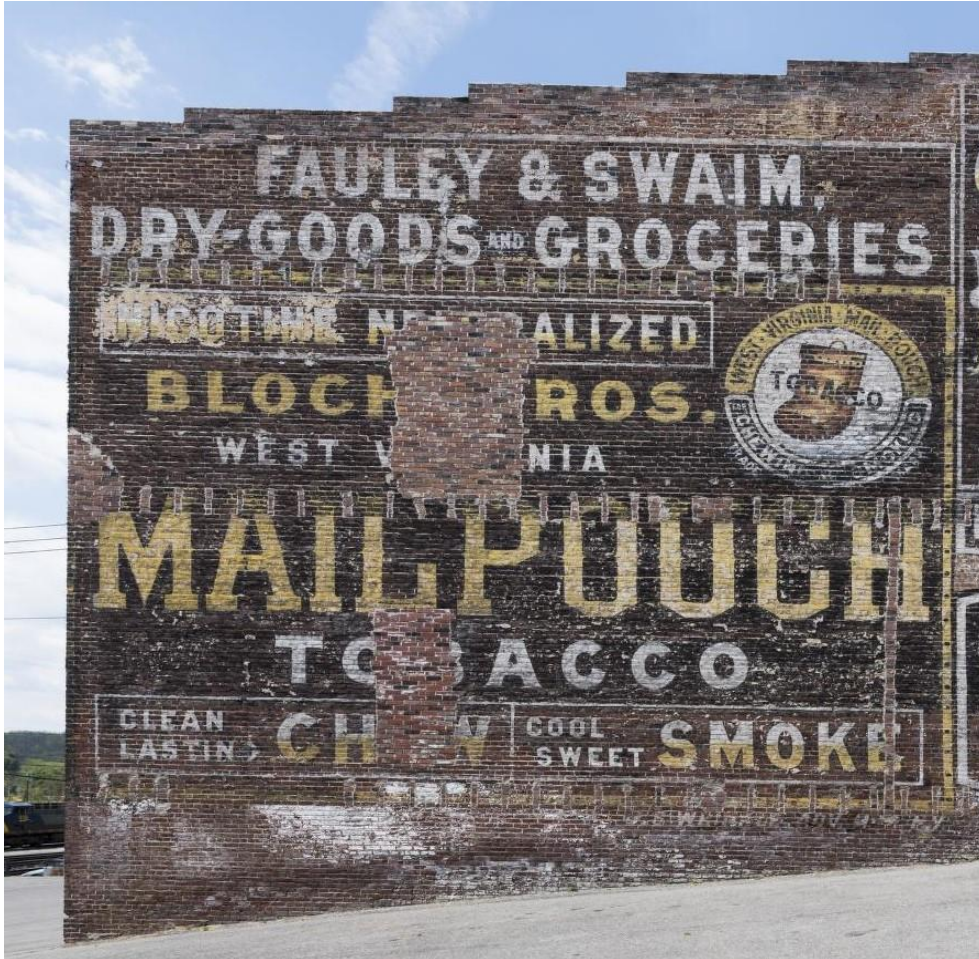
Figure 2 Early example of a Mail Pouch sign on a commercial building in Grafton, WV.

Around 1910 the design of the signs was simplified so they would take less time to paint, and so consumers would remember them more easily (Figure 3). It consisted of the phrase “Chew Mail Pouch Tobacco, Treat Yourself to the Best” in a simple font, against a black background, sometimes with a blue border to frame it. The words “chew” and “treat yourself to the best” would be painted in white, while “Mail Pouch Tobacco” was yellow. If the sign background was not painted black (such as with red barns, for example) the text would often be shadowed in black. In rarer instances, the phrase “treat yourself to the best” would be swapped with “regular or sweet,” or “chewing serves to steady the nerves.” 9