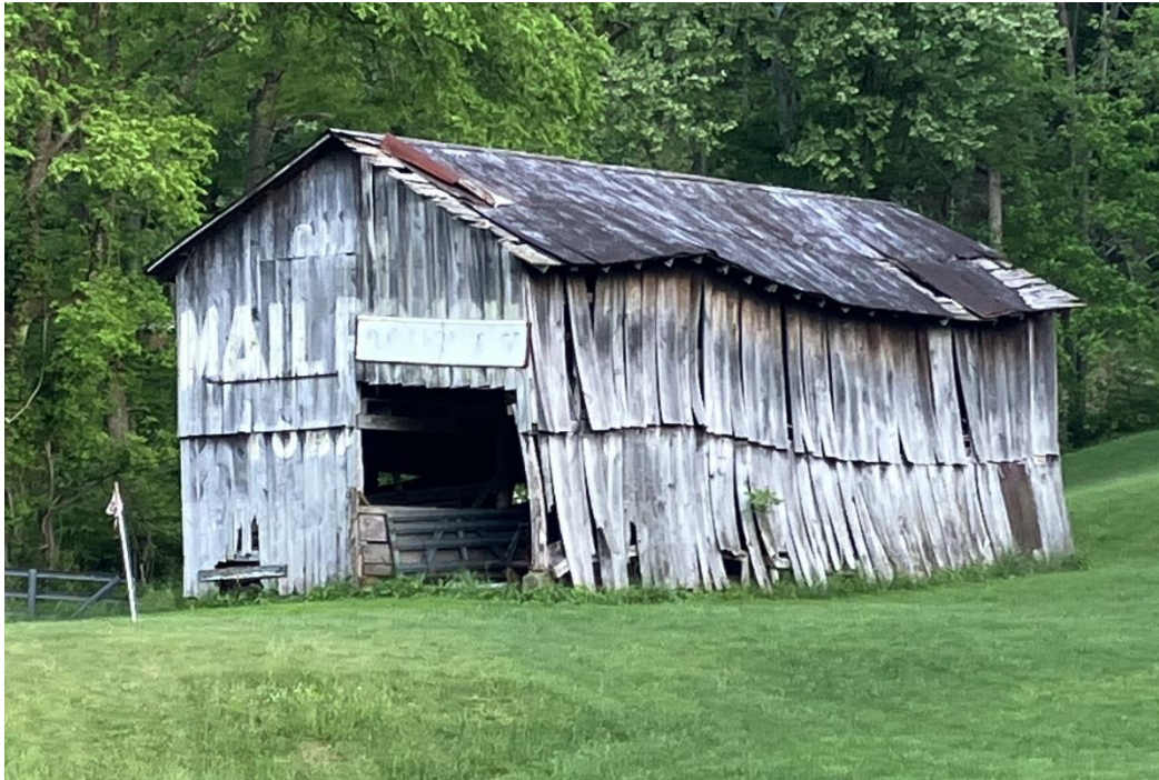
Figure 7 Many Mail Pouch Barns, such as this example in Wayne County, WV, suffer from neglect, both to the signs and the physical integrity of the barns themselves.

The biggest threat to Mail Pouch barns, however, is demolition by neglect. After the final discontinuation of the barn painting program in 1993, many signs have suffered from lack of maintenance. Some, not being repainted for decades, have faded away entirely. Due to the decline of rural populations and active farms, some barns were abandoned or otherwise left unused. Many collapsed from deterioration or became so structurally unsound that they had to be demolished. These issues persist today and remain a challenge to the preservation of Mail Pouch barns.