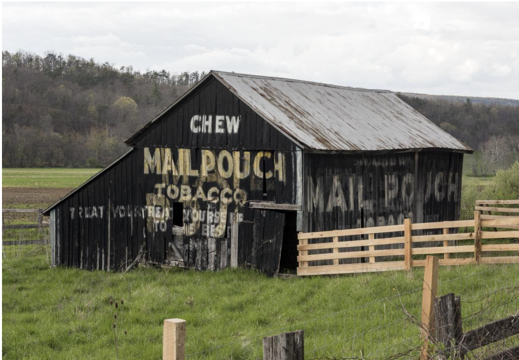
Figure 6 Example of Multi-layered ghost signs on a fading Mail Pouch Barn.

Crews tried to repaint the signs about every three to five years depending on the exposure of the paint to the weather. Even when they stopped being repainted, the quality and thickness of the paint caused many Mail Pouch signs to linger for decades after they first began fading. On some barns, the fading of the most recent paint layer has exposed earlier versions of the sign underneath, creating fascinating and multilayered ghost signs. 43