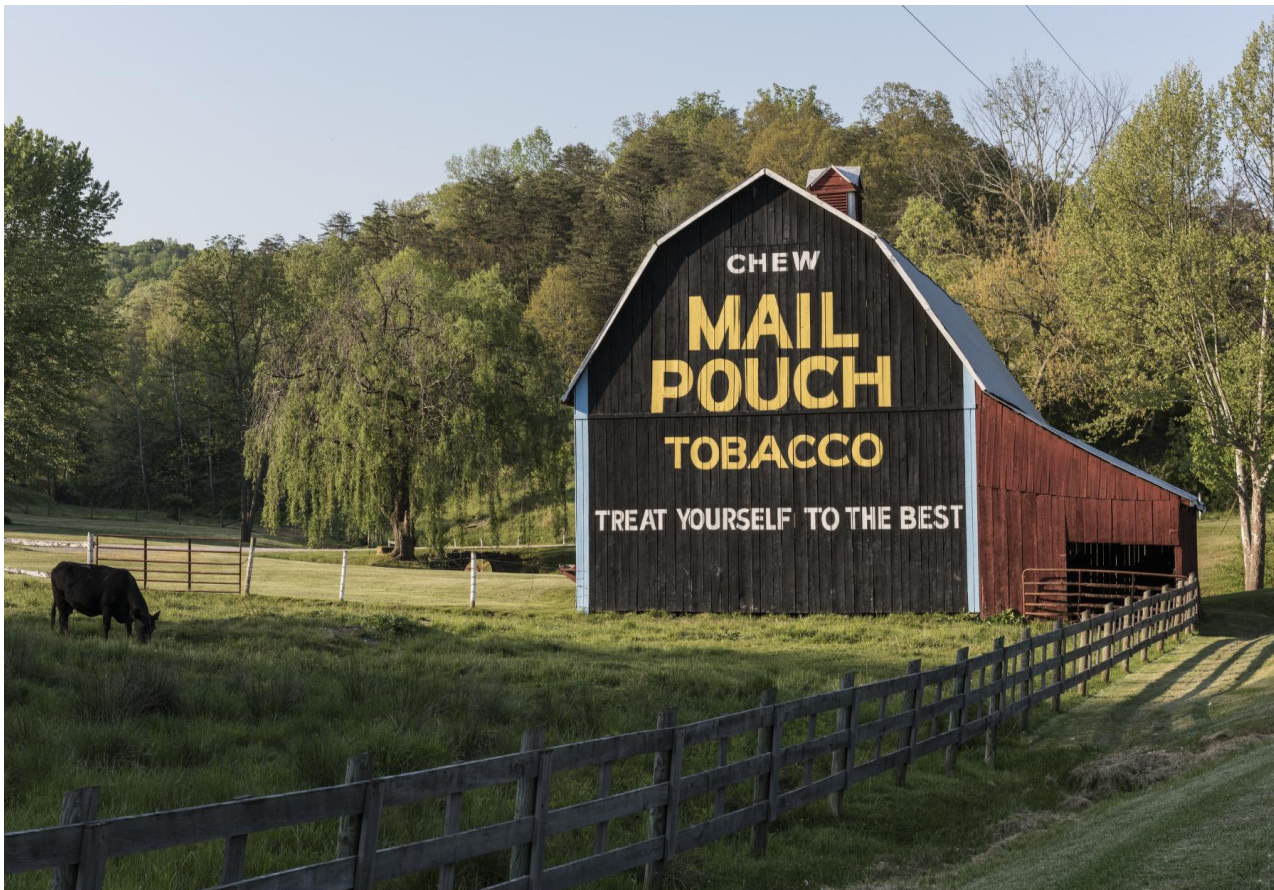
Figure 3 The Hutchinson-Parsons-Fulk Barn in Sandyville, WV is a well-preserved example of the typical Mail Pouch Barn.