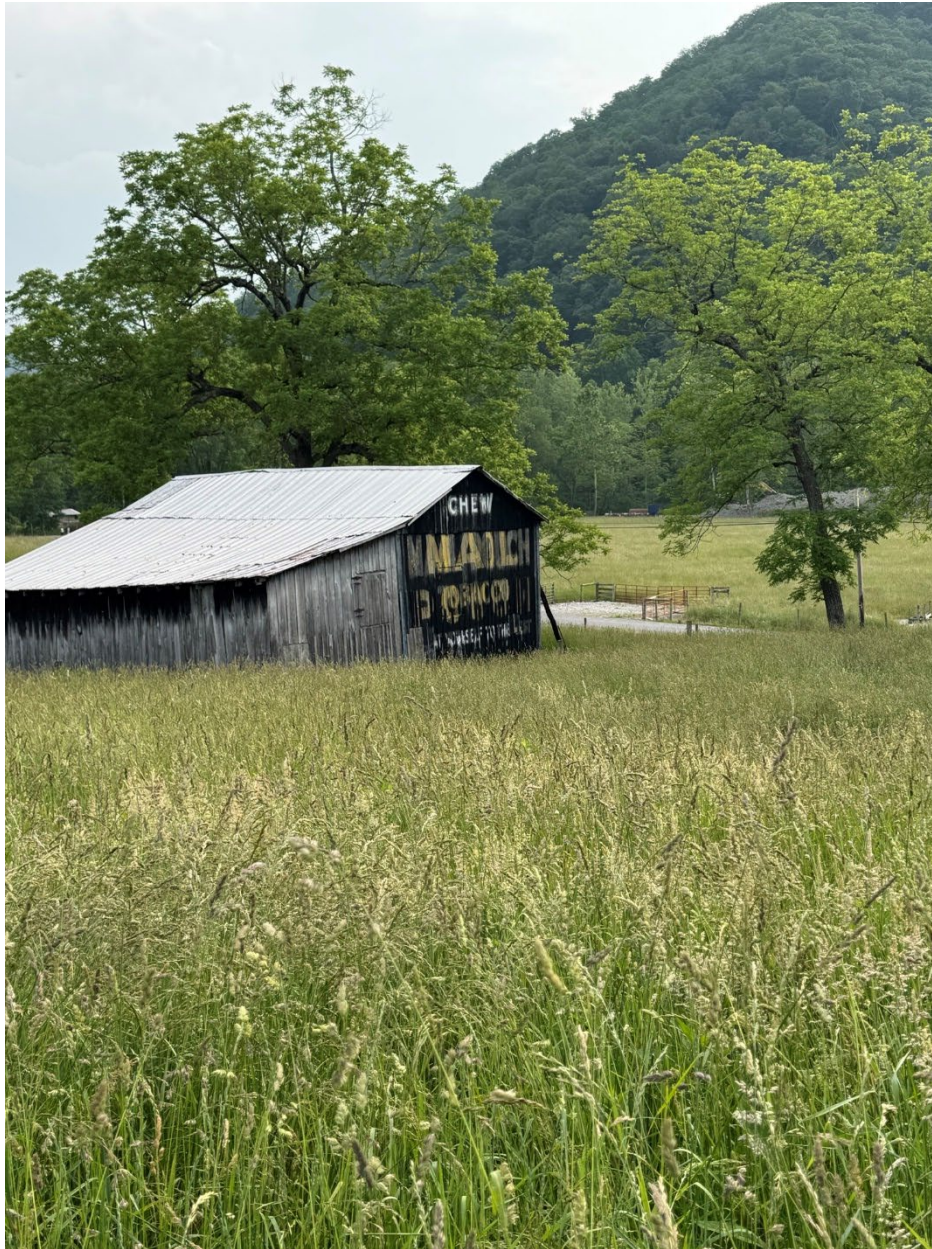
Photo 1 North side of barn, northeast elevation