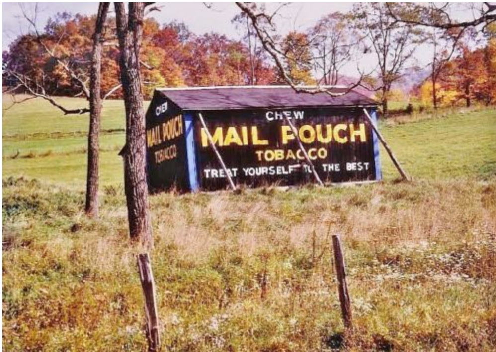
Figure 5 Barn in 1984.