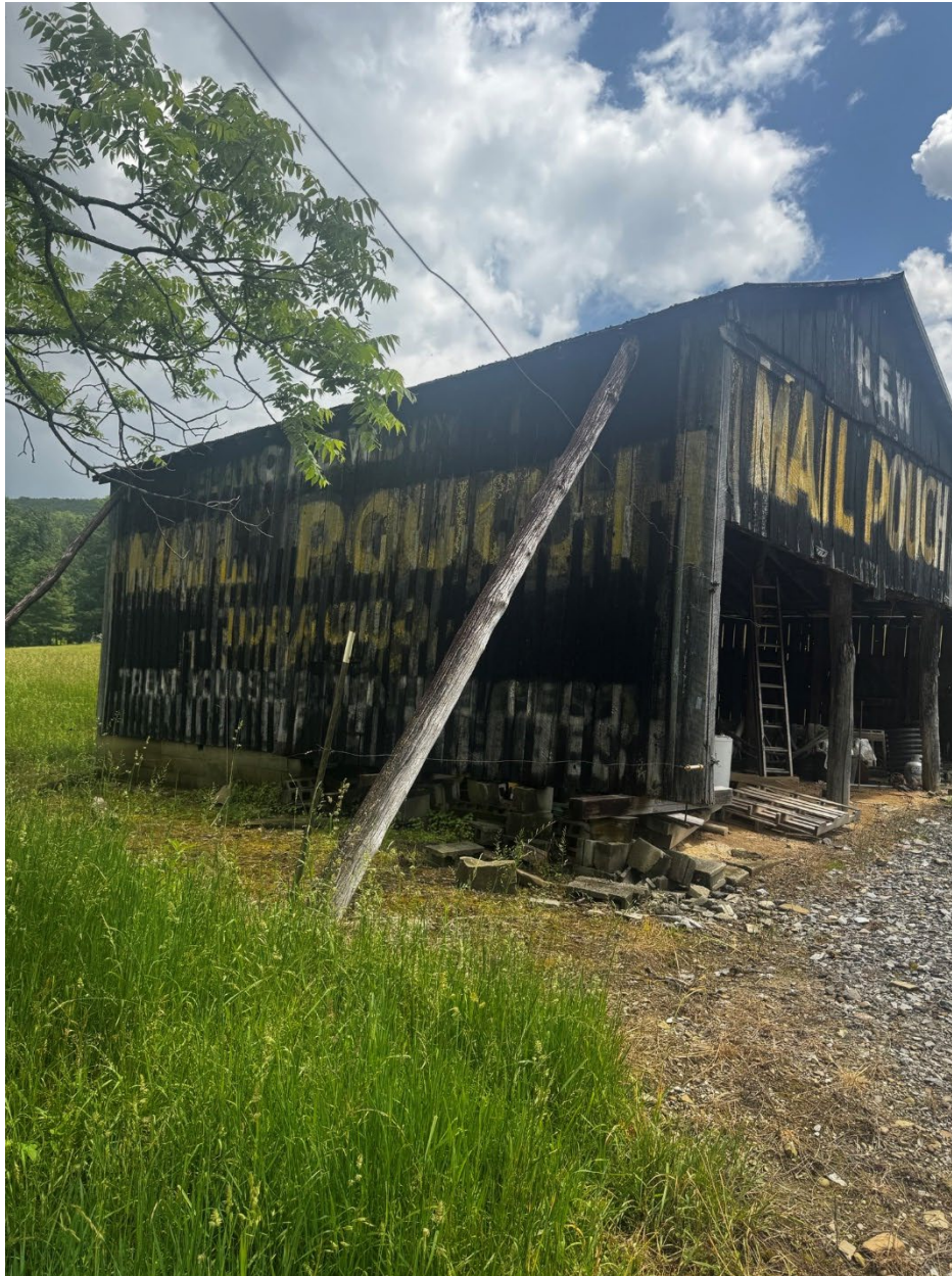
Photo 3 West side of barn, southwest elevation