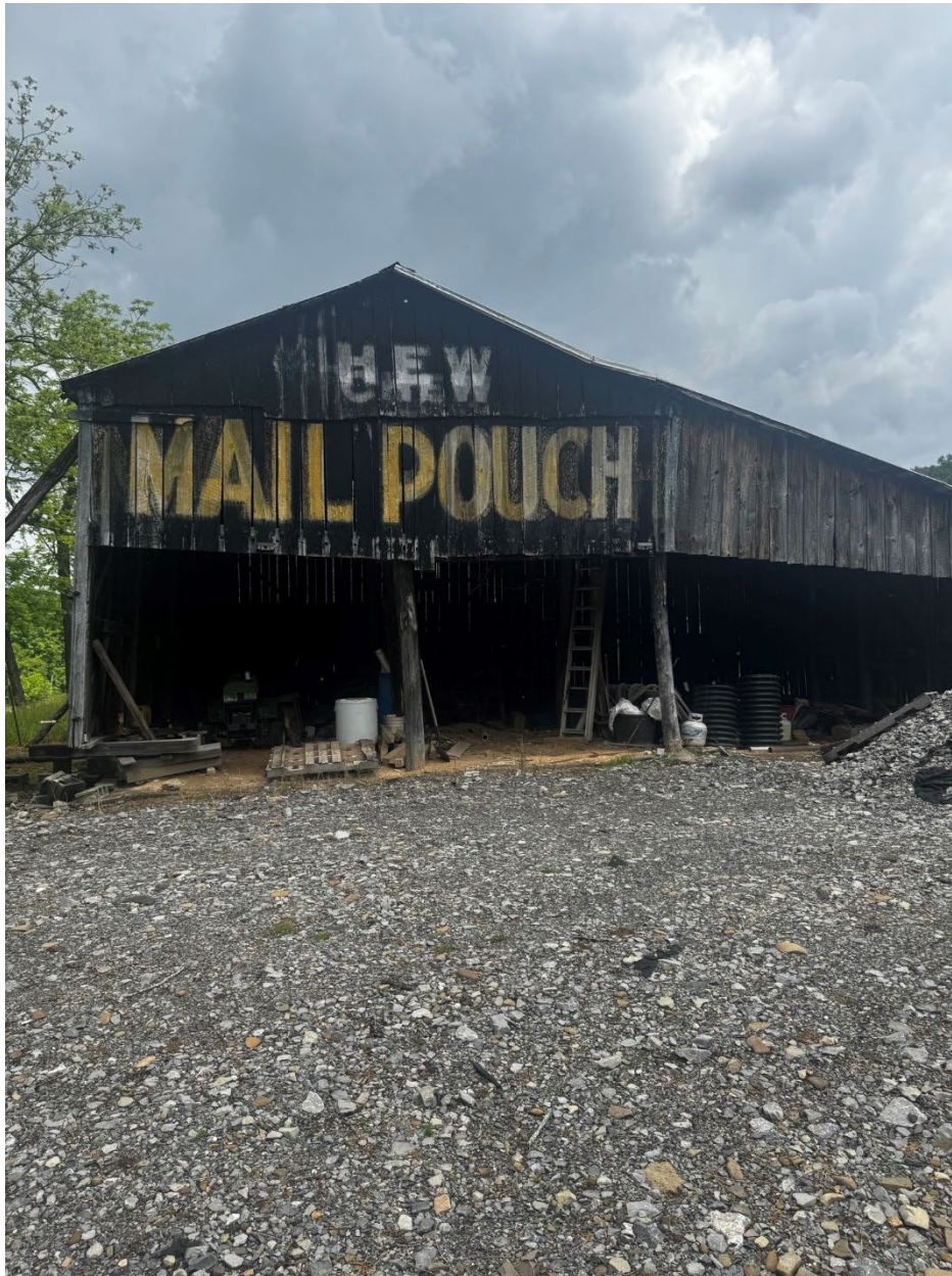
Photo 2 South side of barn, south elevation