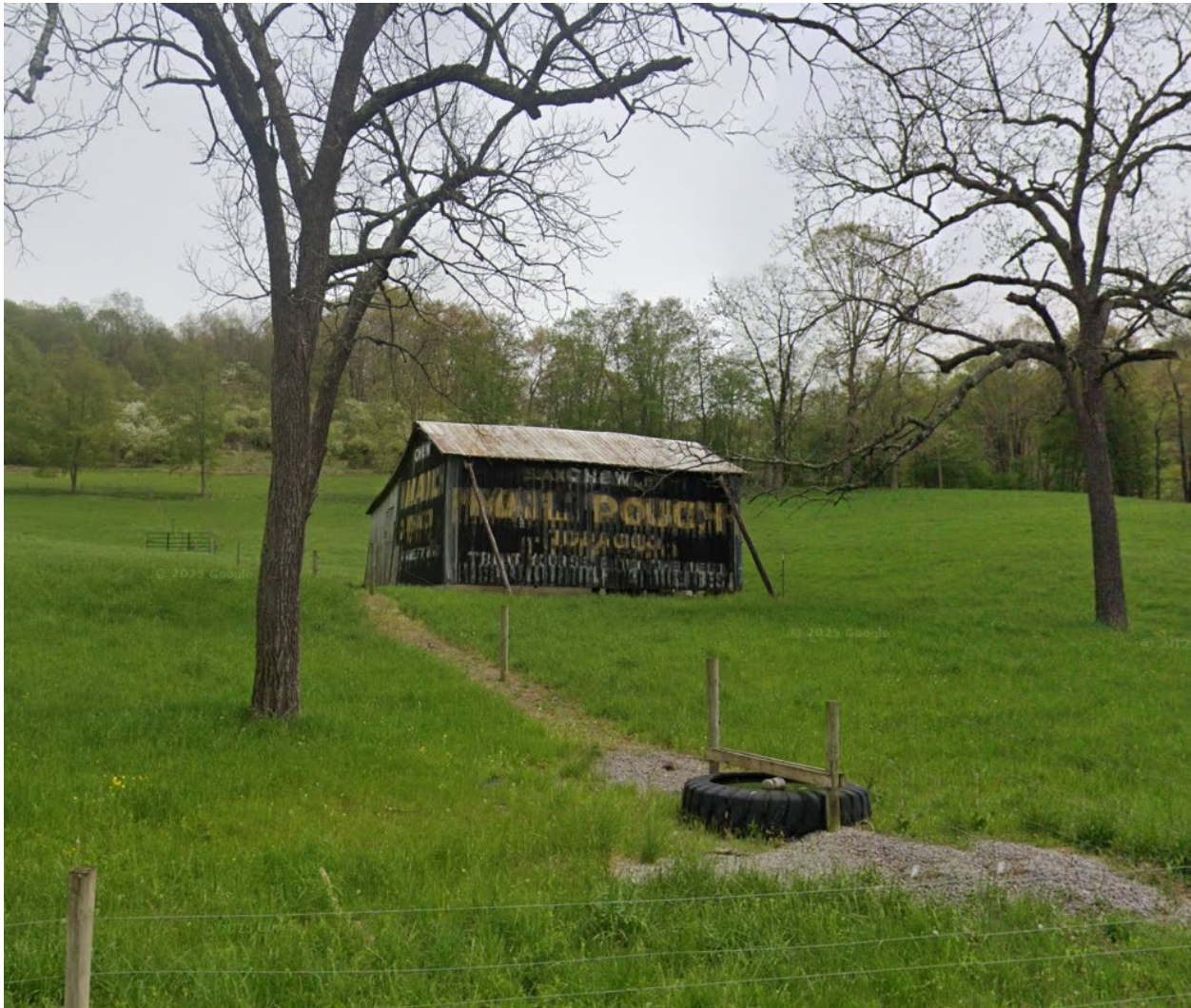
Figure 6 Barn as seen on Google Street View in May 2025.