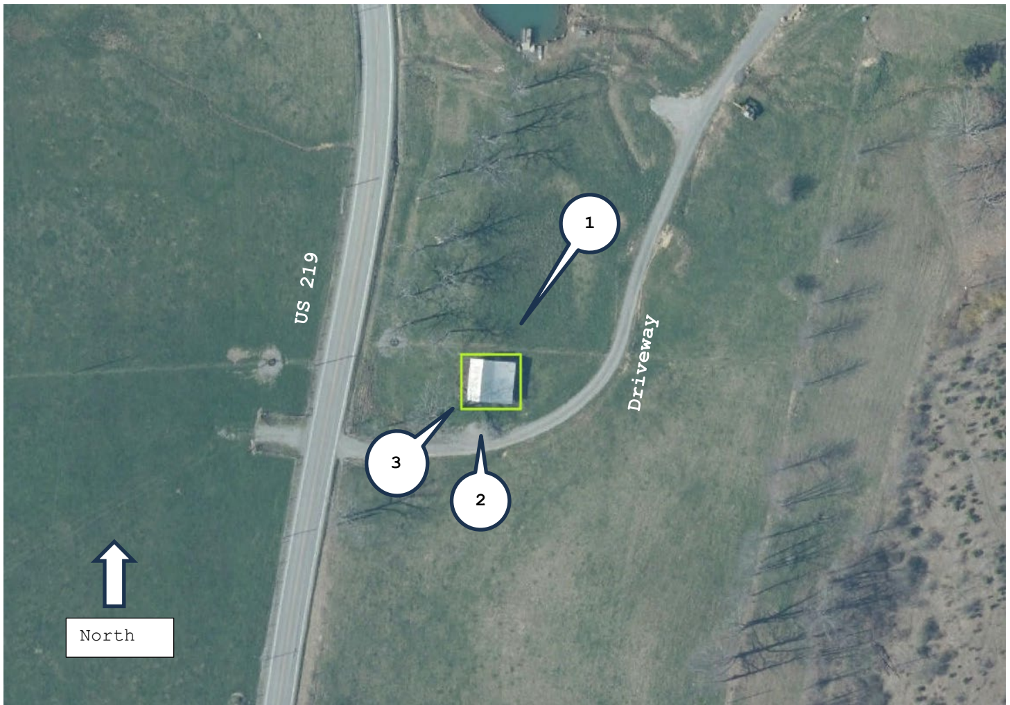
Figure 2 Boundary Outline and Photo Key