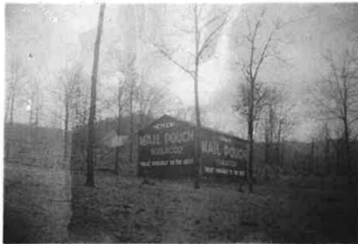
Figure 3 Photograph of Barn, circa 1940s.