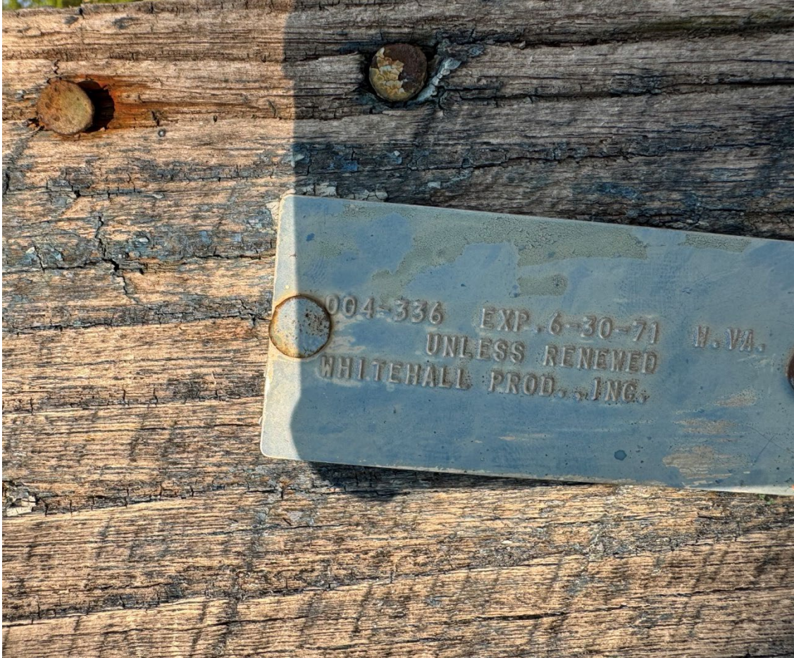
Figure 7 Advertising License Tag on Barn.