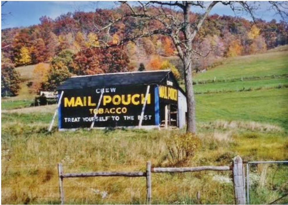
Figure 4 Barn in 1984.