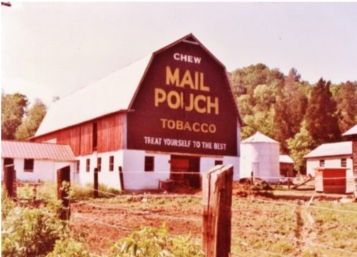
Figure 3 Barn in 1988.

Paperwork Reduction Act Statement: This information is being collected for nominations to the National Register of Historic Places to nominate properties for listing or determine eligibility for listing, to list properties, and to amend existing listings. Response to this request is required to obtain a benefit in accordance with the National Historic Preservation Act, as amended (16 U.S.C.460 et seq.). We may not conduct or sponsor and you are not required to respond to a collection of information unless it displays a currently valid OMB control number.