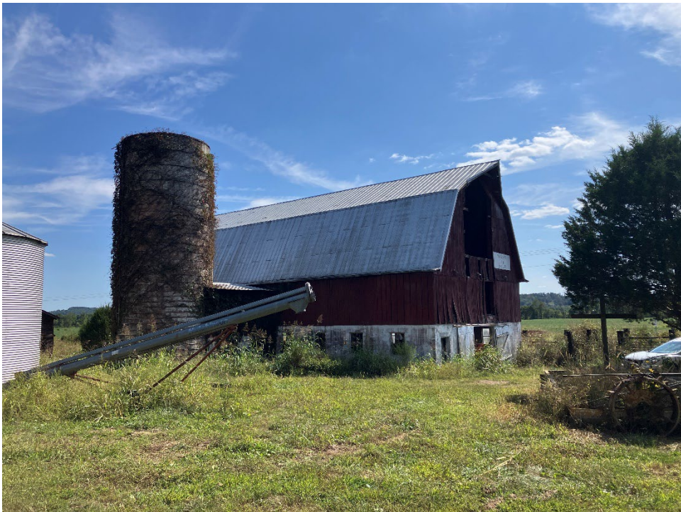
Photo 3 Northeast side of barn, camera facing southeast