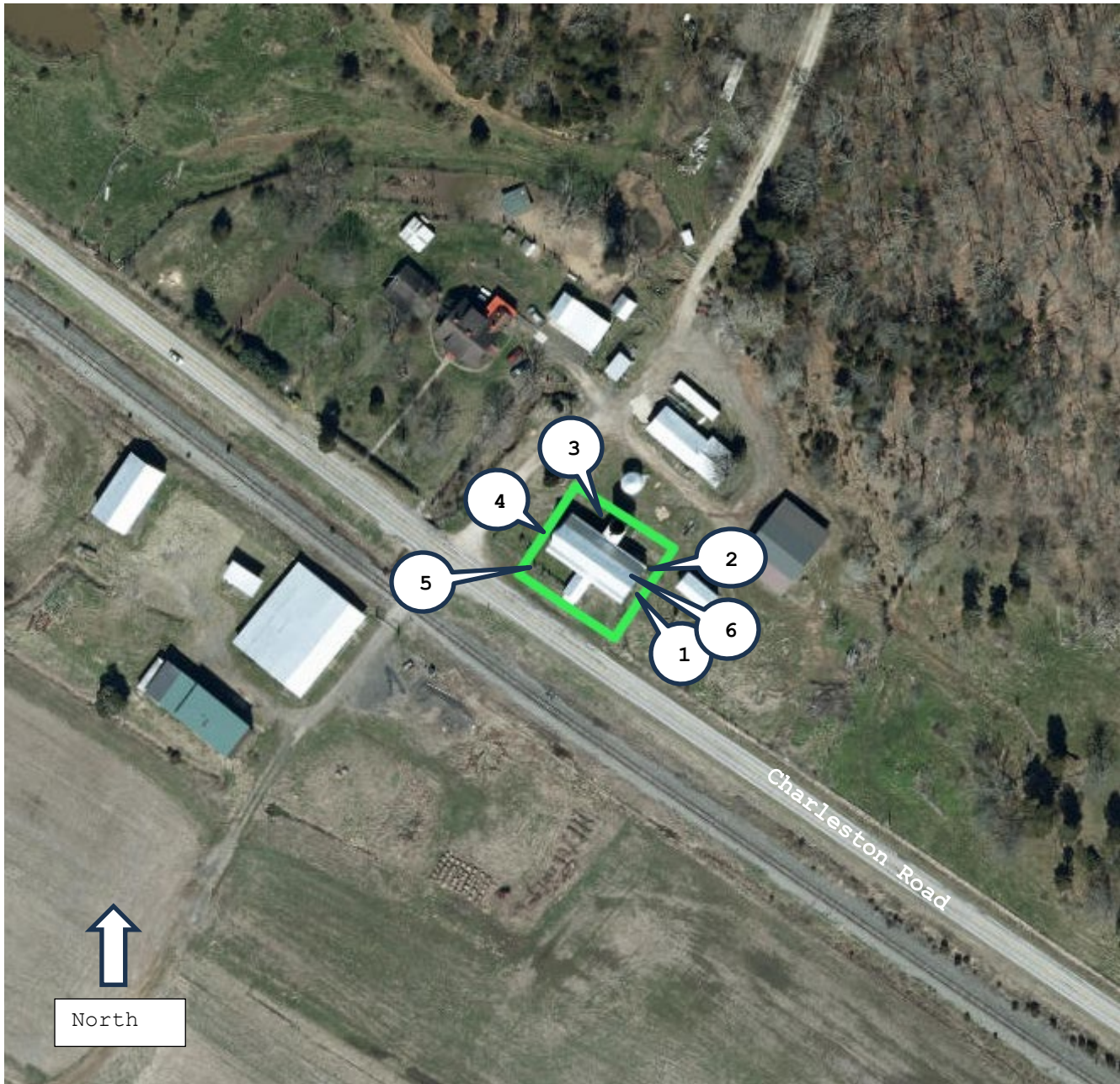
Figure 2 Boundary Outline and Photo Key