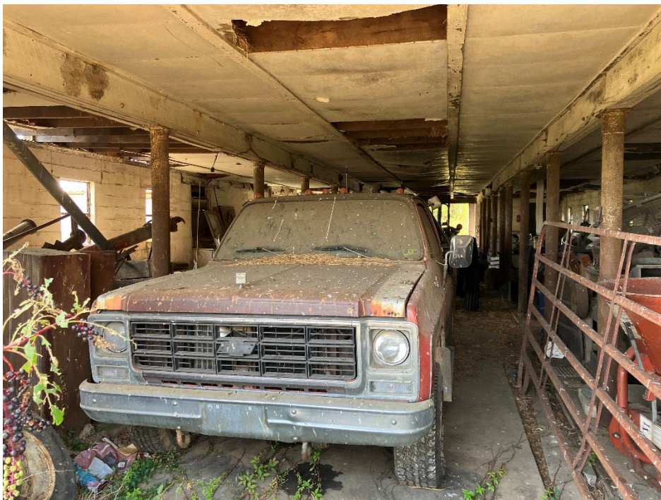
Photo 6 Interior of ground floor, camera facing northwest