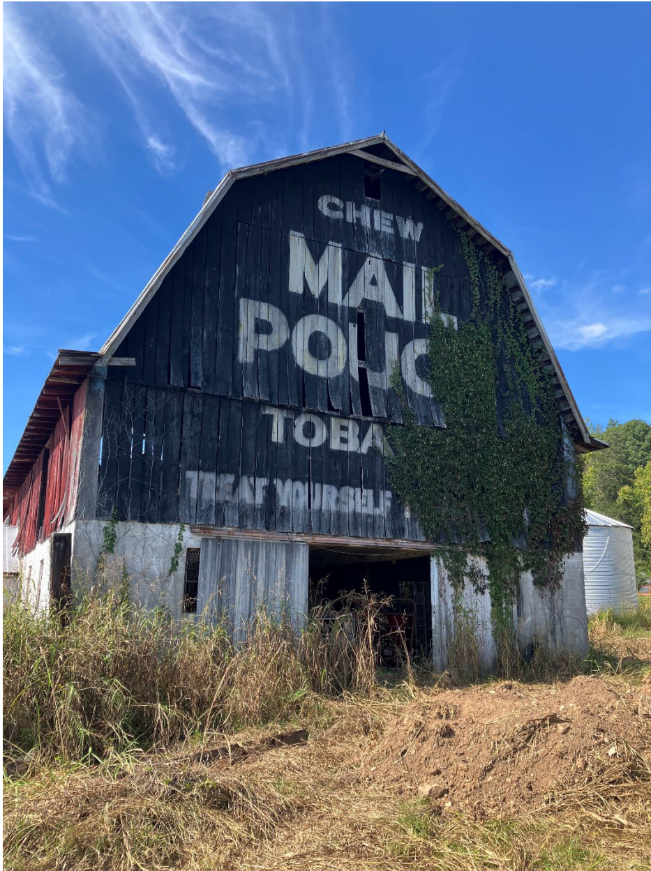
Photo 1 Southeast side of barn, camera facing northwest