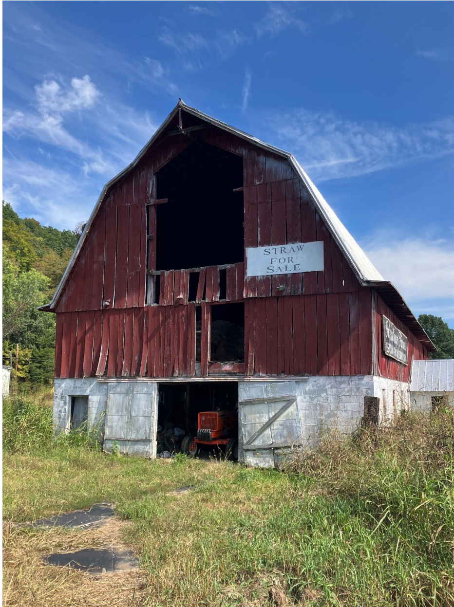
Photo 4 Northwest side of barn, camera facing southeast