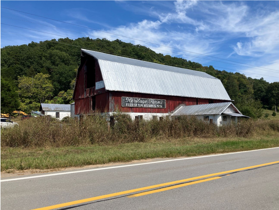
Photo 5 Southwest side of barn, camera facing northeast