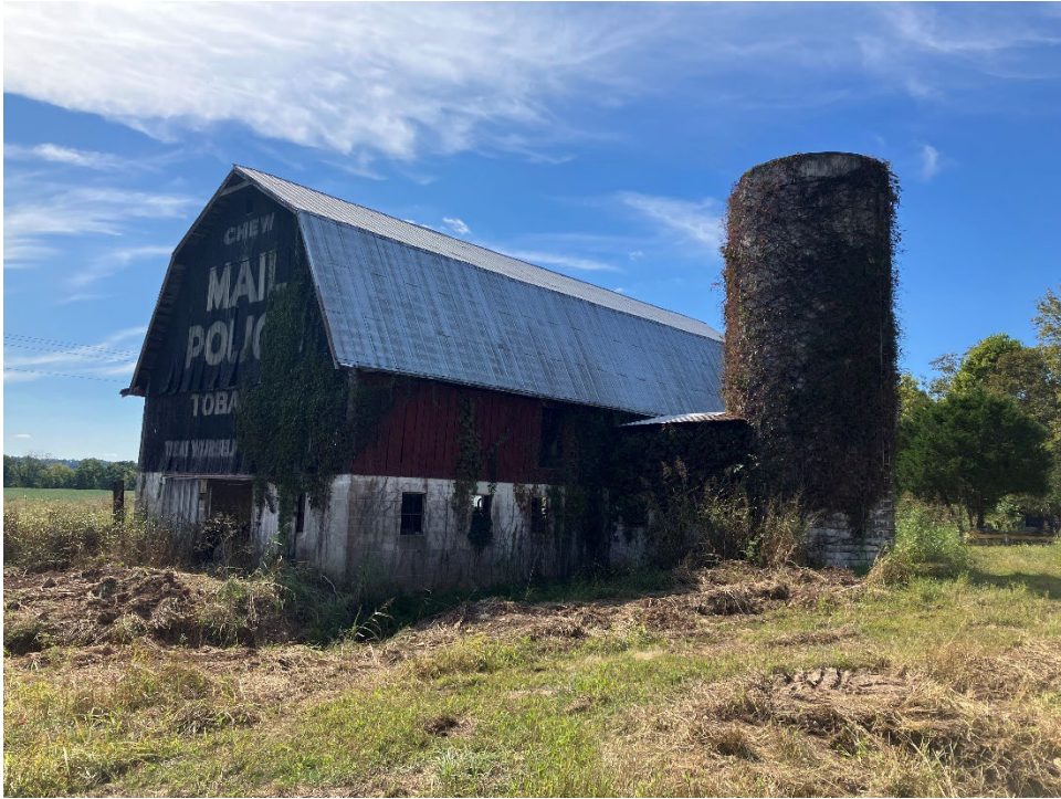
Photo 2 Northeast side of barn, camera facing southwest