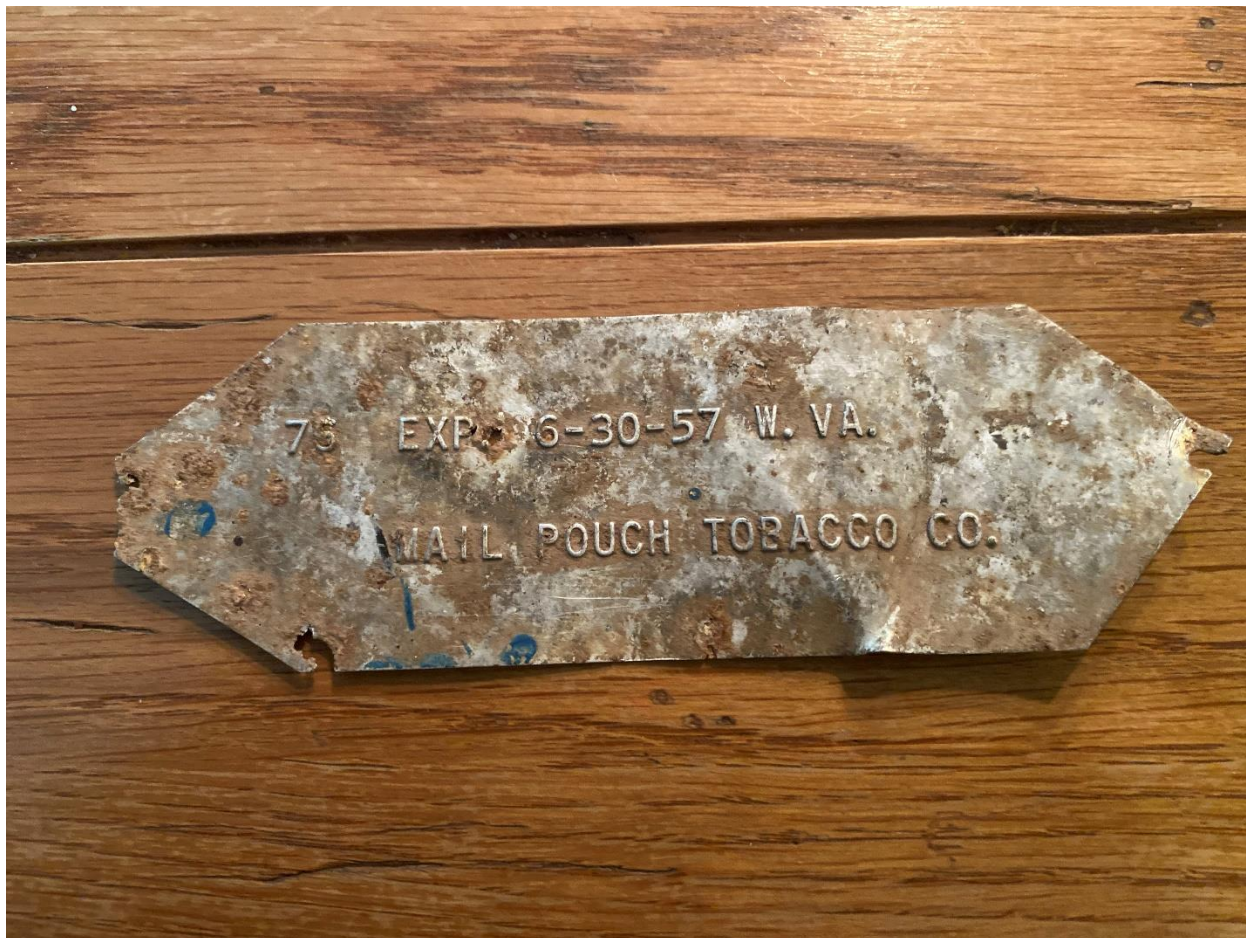
Figure 6 Advertising license found at the barn.

Paperwork Reduction Act Statement: This information is being collected for nominations to the National Register of Historic Places to nominate properties for listing or determine eligibility for listing, to list properties, and to amend existing listings. Response to this request is required to obtain a benefit in accordance with the National Historic Preservation Act, as amended (16 U.S.C.460 et seq.). We may not conduct or sponsor and you are not required to respond to a collection of information unless it displays a currently valid OMB control number.