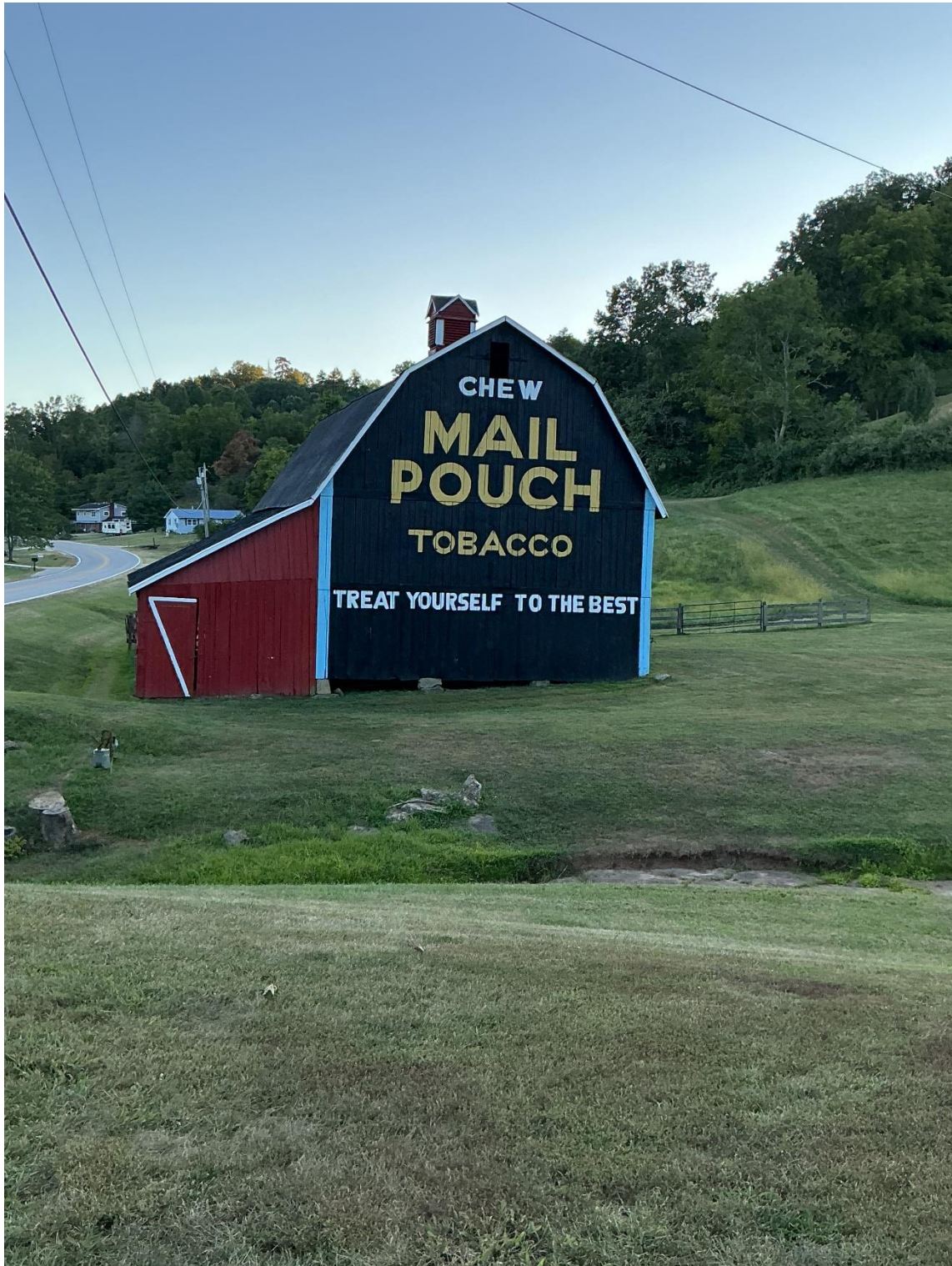
Photo 2 North side of barn, camera facing south