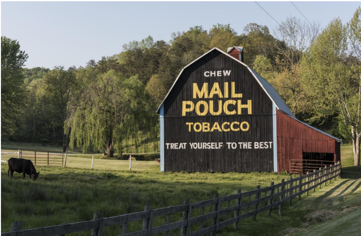
Figure 5 shot of the barn in 2015.