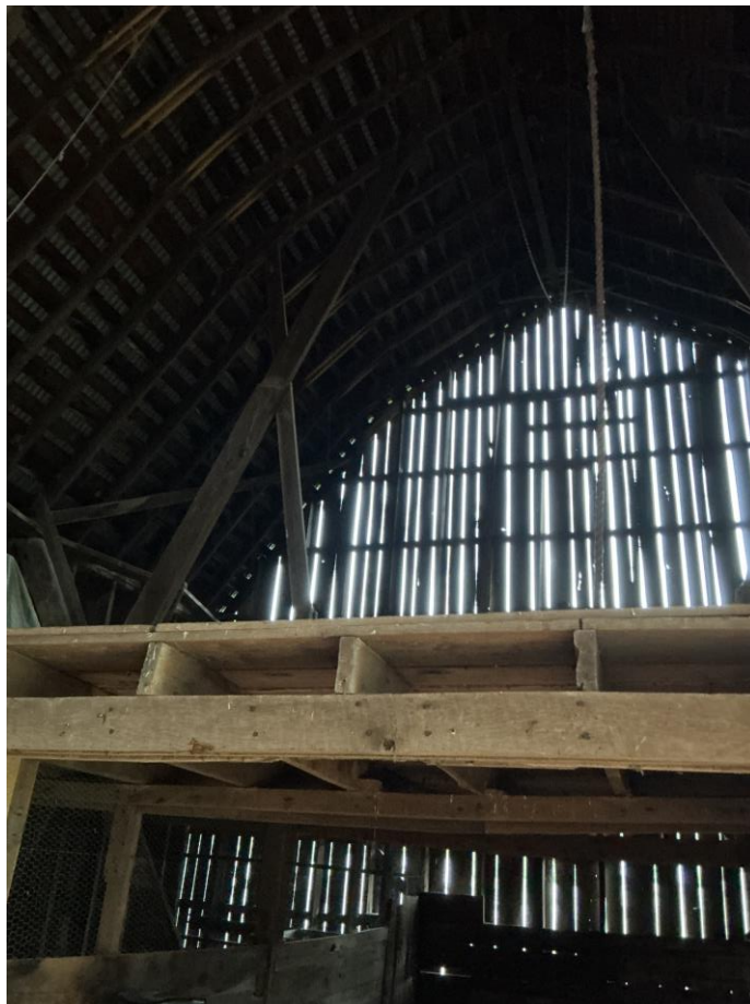
Photo 4 Barn interior, camera facing south