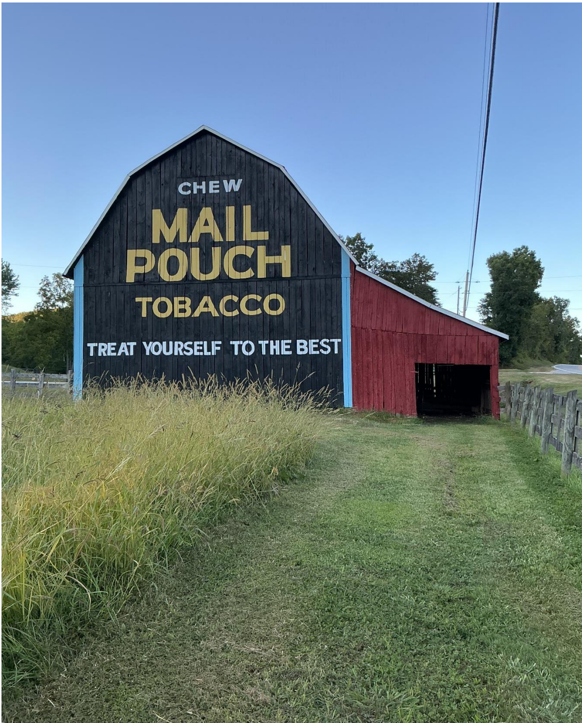
Photo 1 South side of barn, camera facing north.