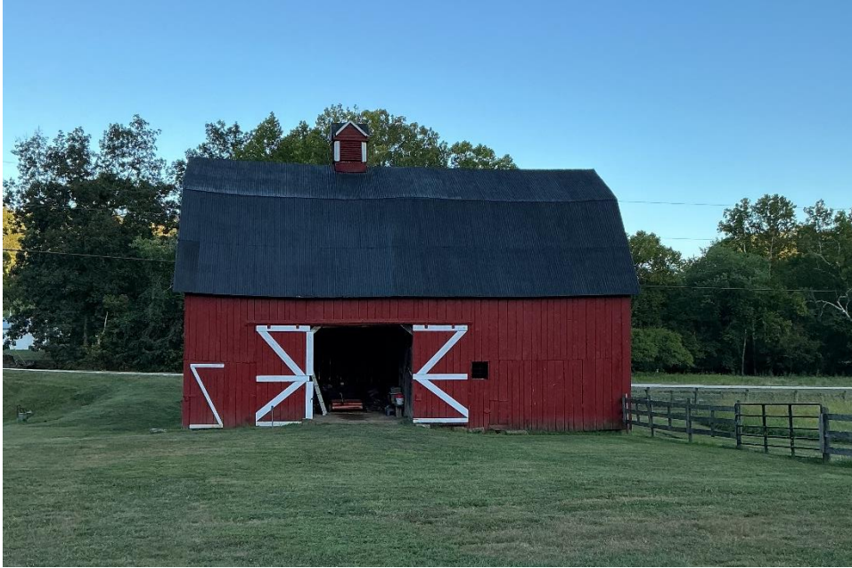
Photo 3 West side of barn, camera facing east