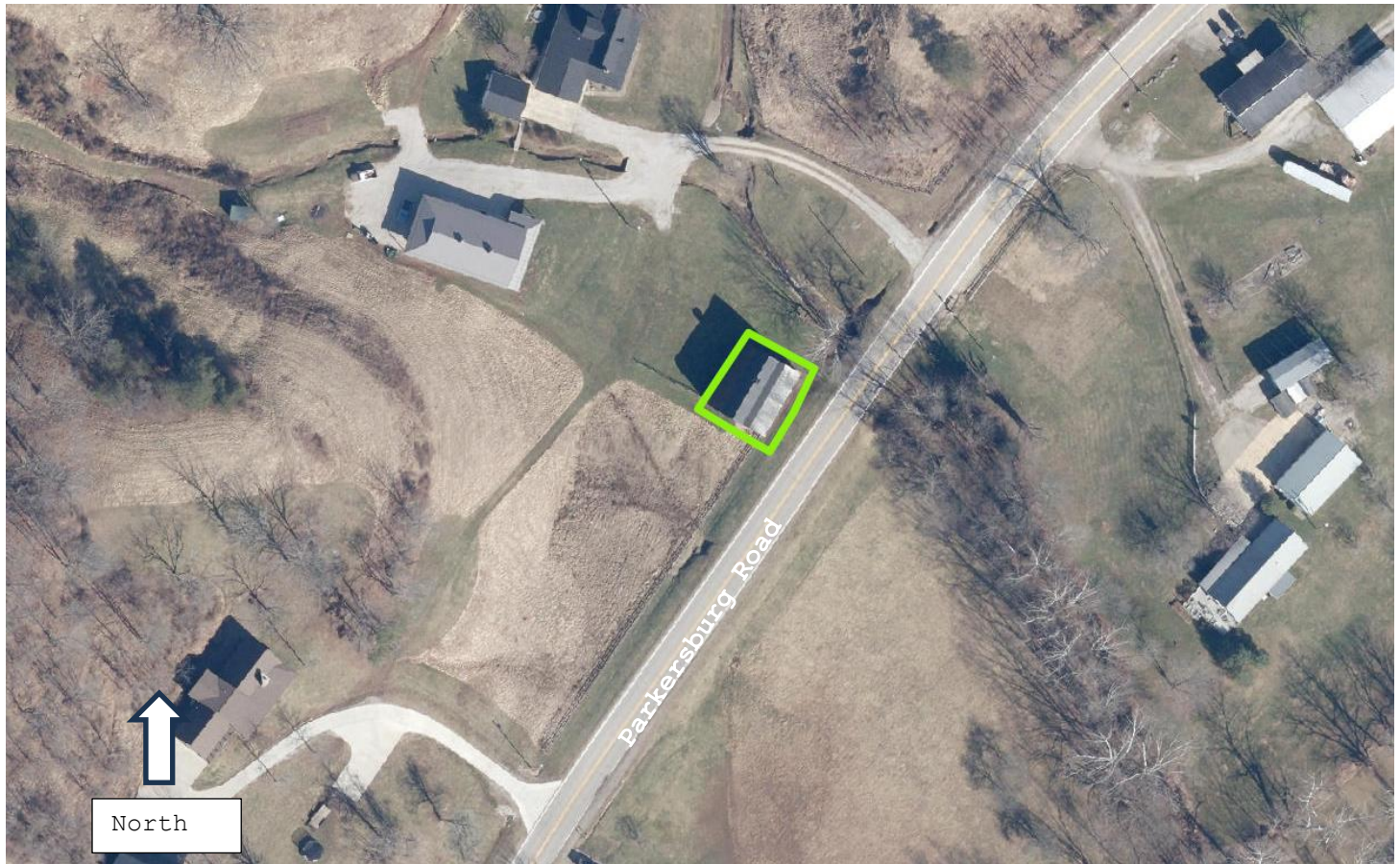
Figure 2 Boundary Outline