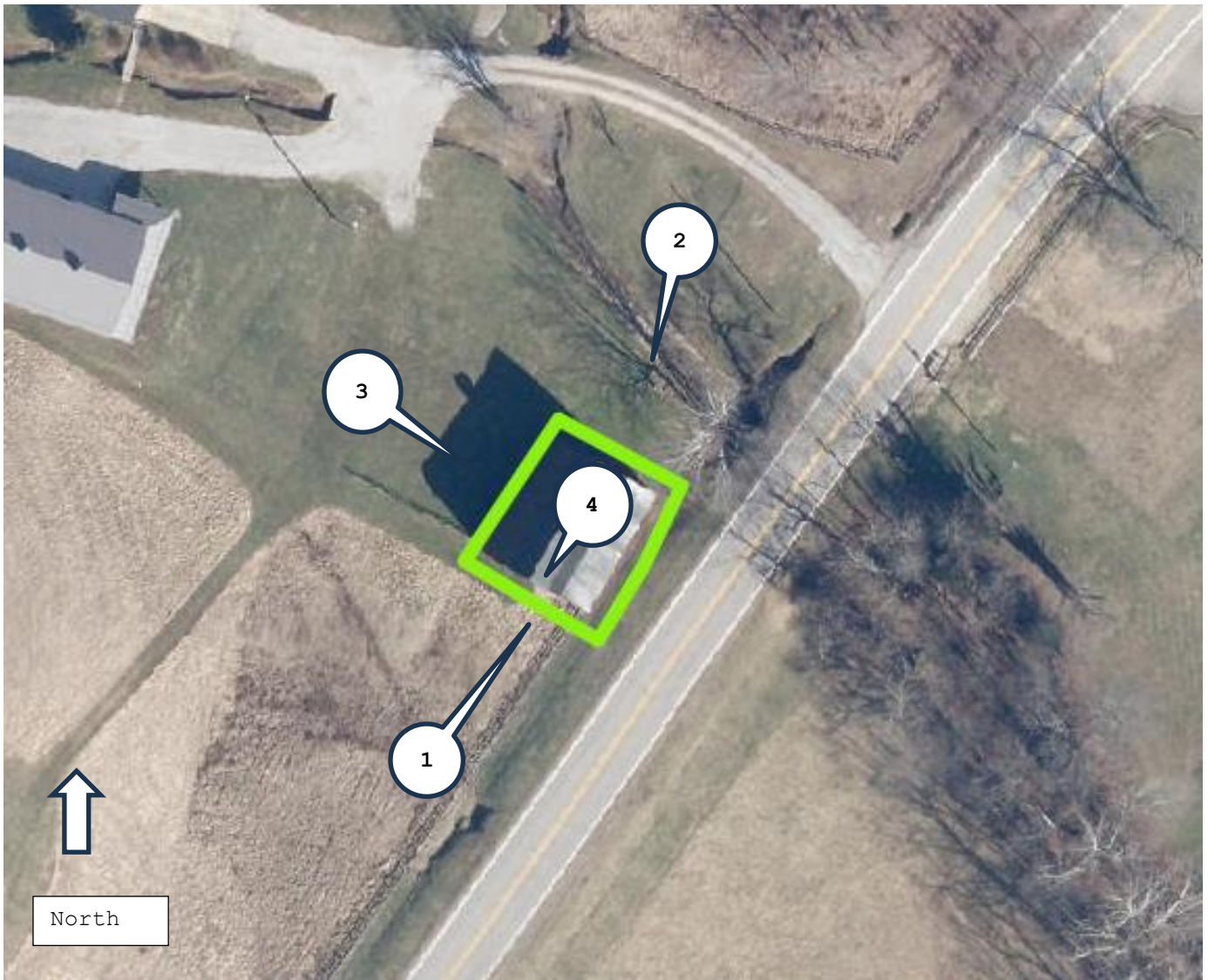
Figure 3 Photo Key