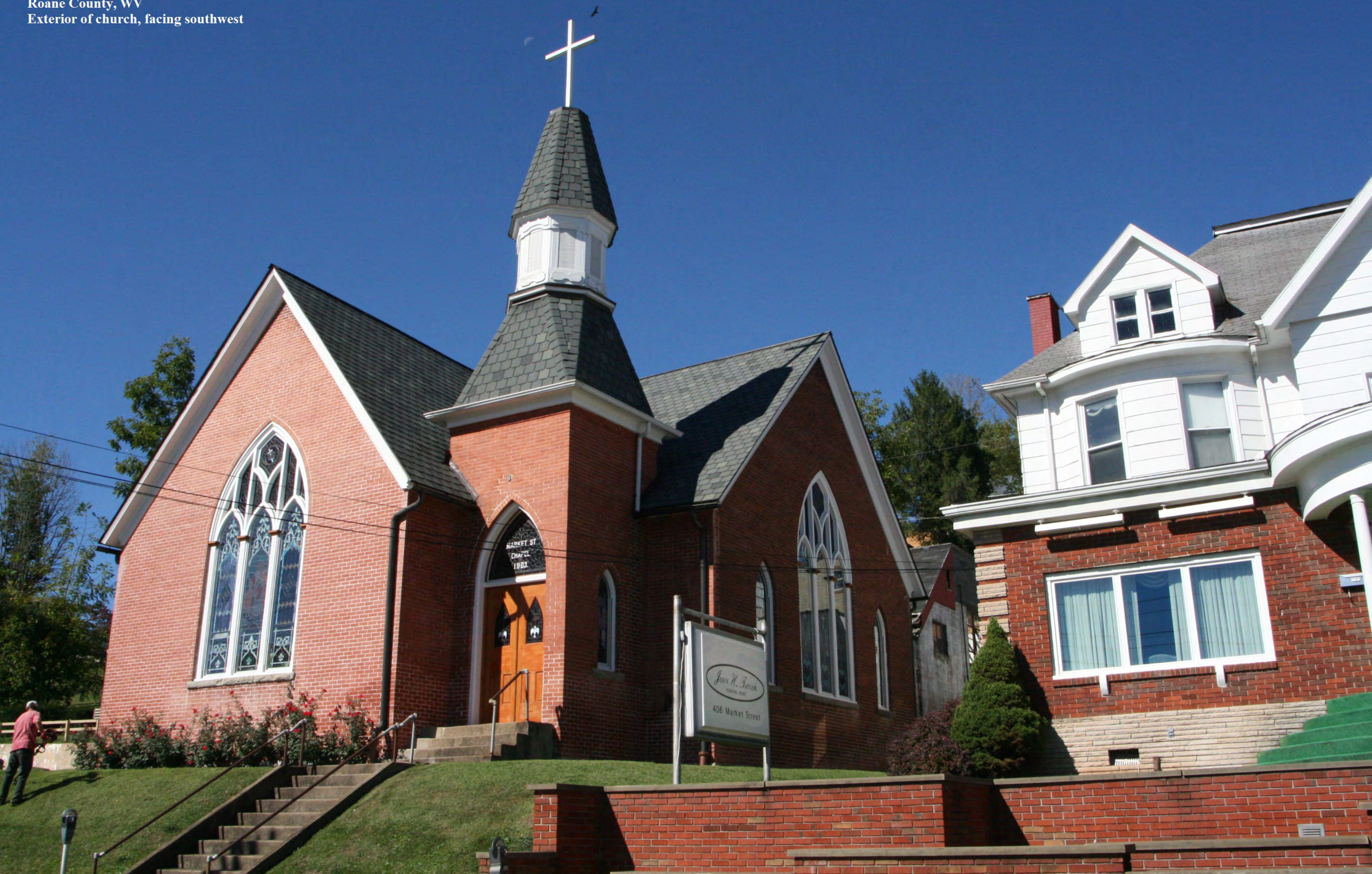
Photo 1 of 8: Spencer Presbyterian Church Roane County, WV Exterior of church, facing southwest