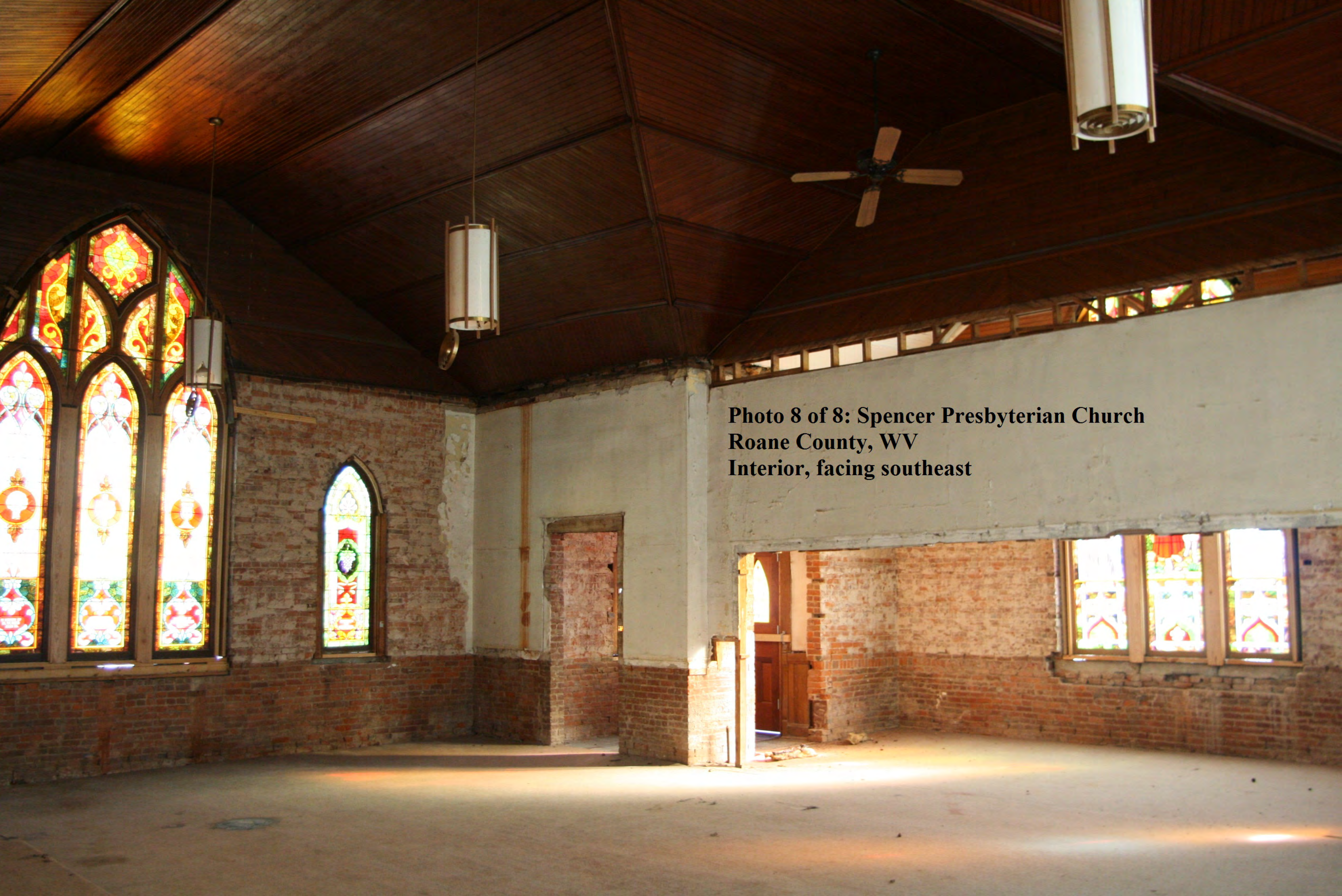
Photo 8 of 8: Spencer Presbyterian Church Roane County, WV Interior, facing southeast