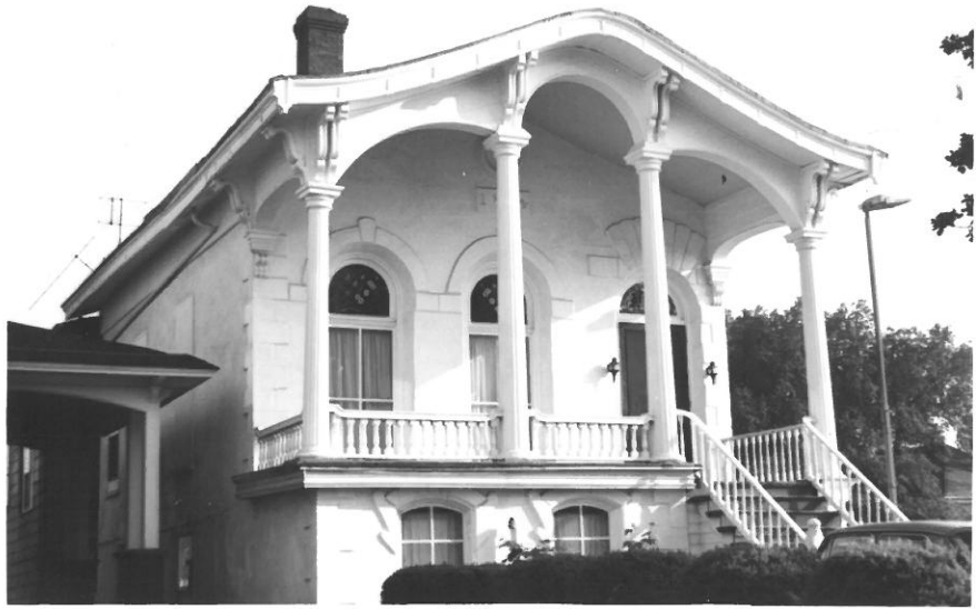
19 • 75