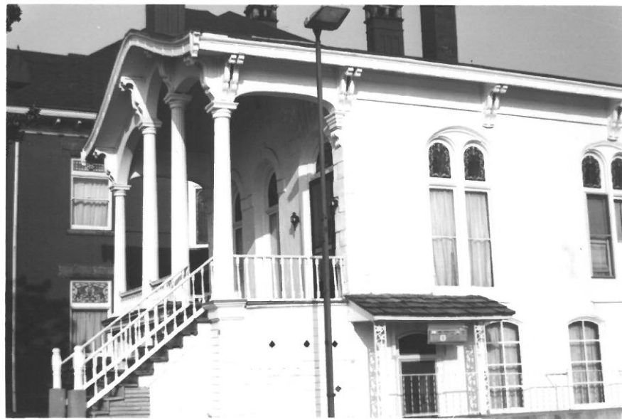
19 • 75