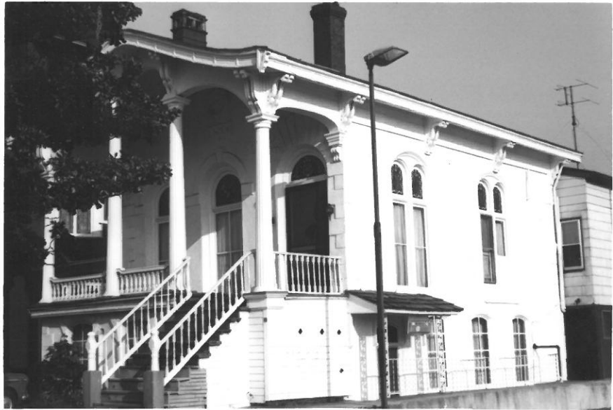
19 • 75