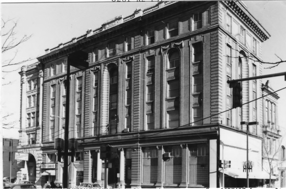
6. LOCALE/ENVIRONMENT (map):