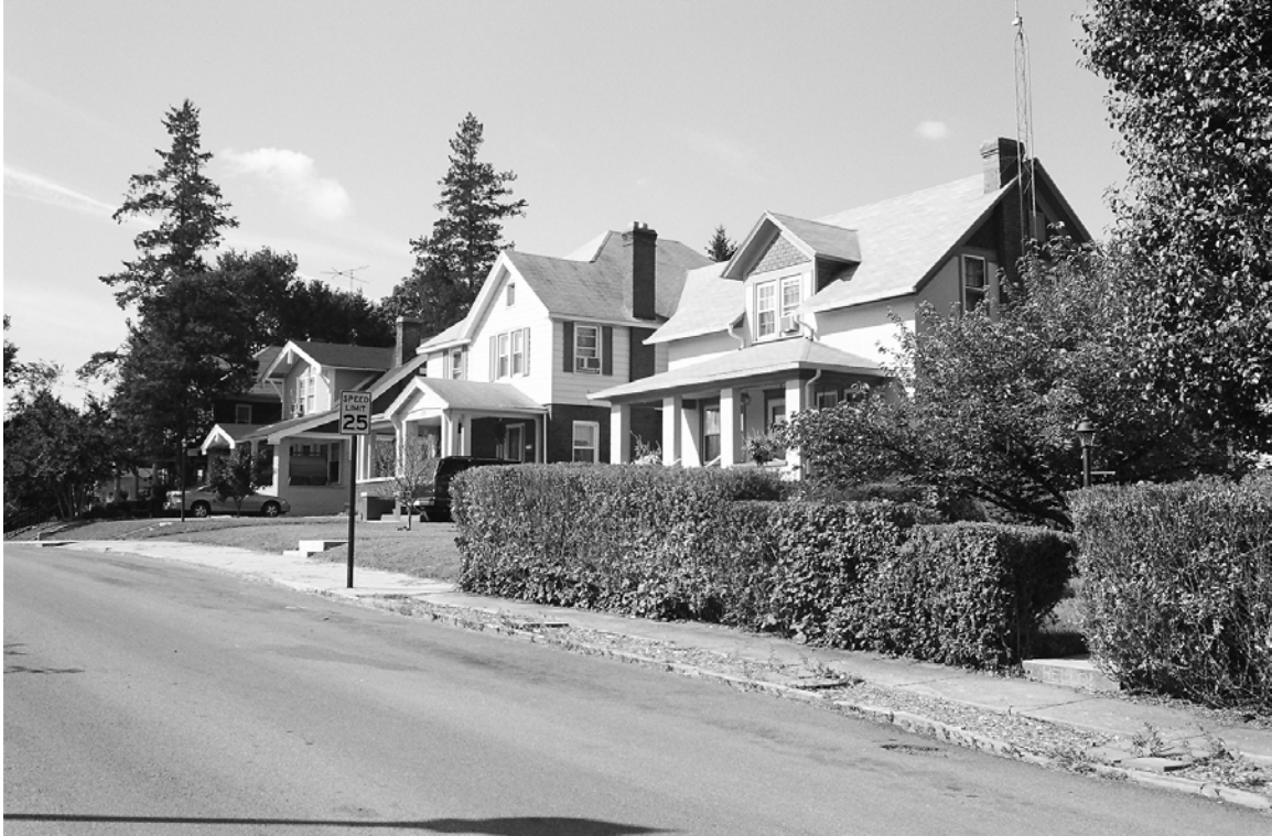
13. Streetscape, west side Boyd Avenue looking southwest, with 374 Boyd Avenue (Resource No. 30) in the foreground.