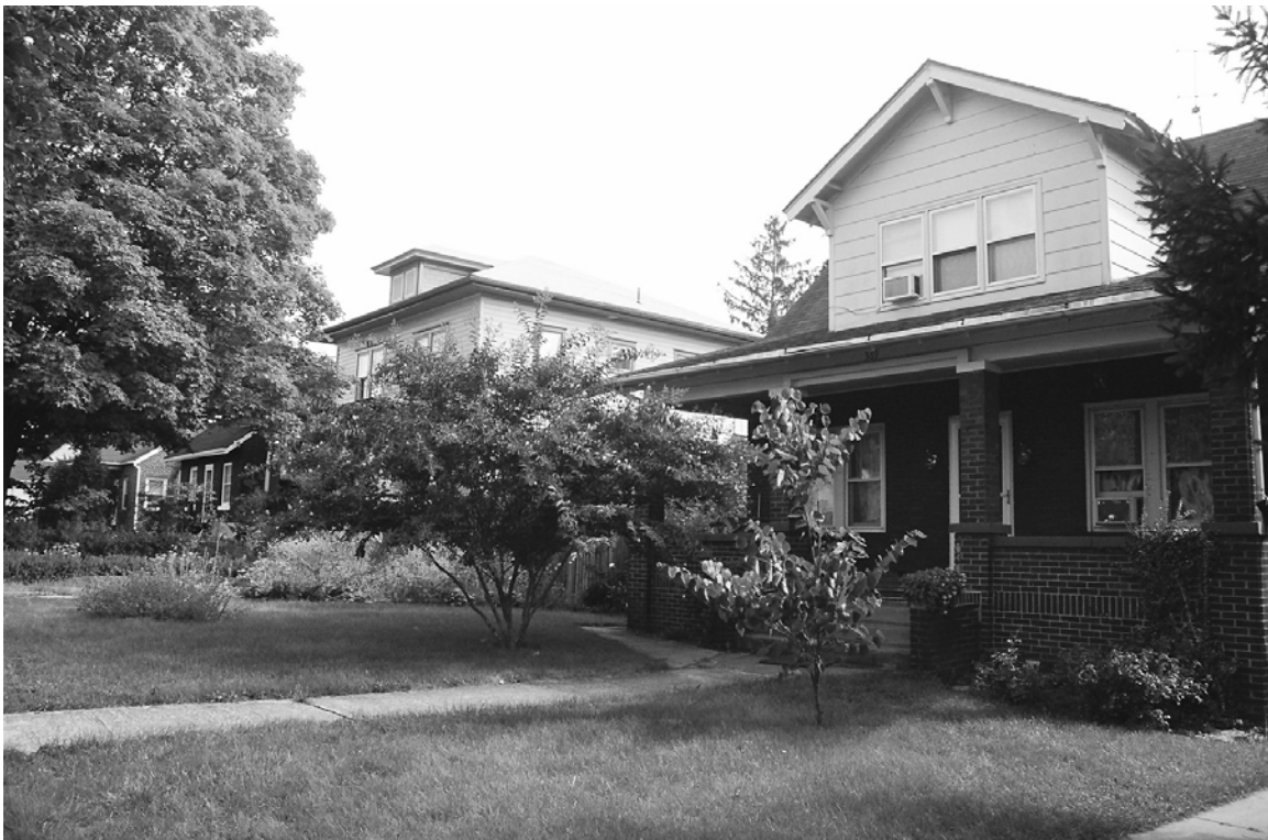
14. Streetscape, east side Boyd Avenue, looking northeast, with 369 Boyd Avenue (Resource No. 39) in the foreground; also illustrates conformity to 30-foot front yard setback requirement.