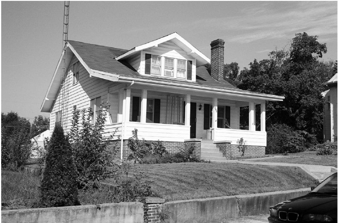
10. 1920s Bungalow at 362 Boyd Avenue (Resource No. 25), southeast perspective looking northwest, showing typical 1½-story Bungalow form, recessed front porch, dormer, etc. Also shown is the concrete and brick retaining wall (Resource No. 62) in front of the house.