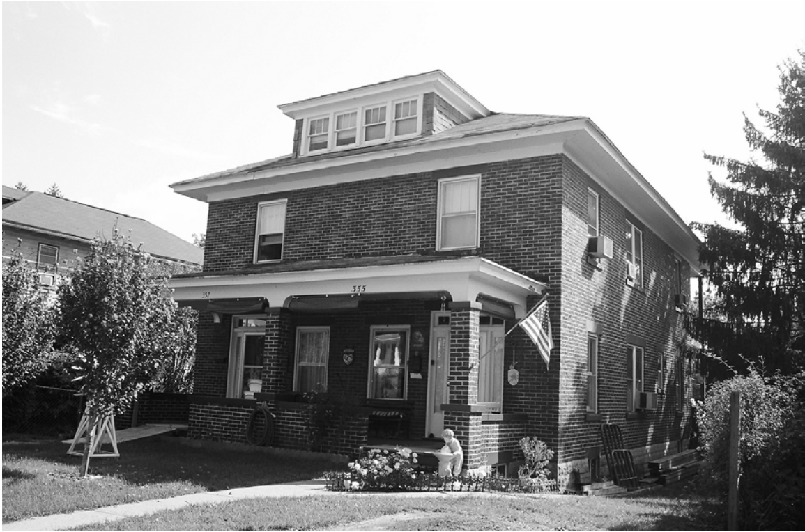
15. American Foursquare double house at 355-357 Boyd Avenue, southwest perspective looking northeast; this is the only original double house in the district.