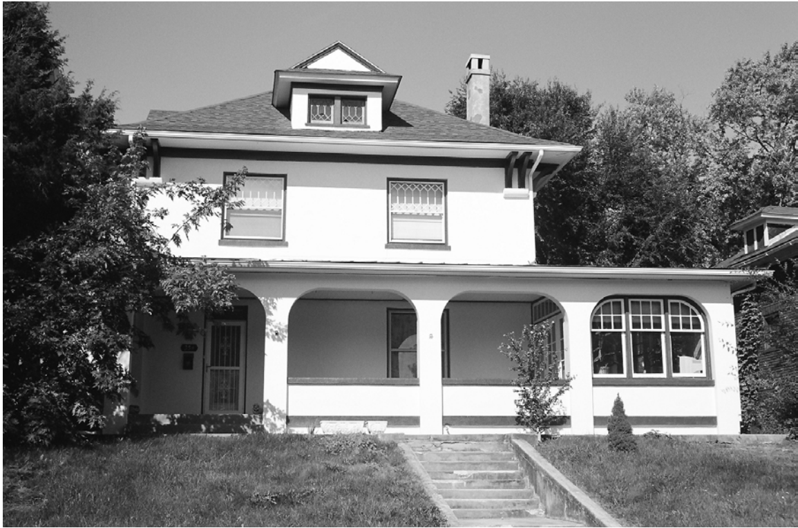
9. 354 Boyd Avenue (Resource No. 22), facade, looking west and showing its general American Foursquare character, with an added wrap-around veranda and sunroom on the north side.