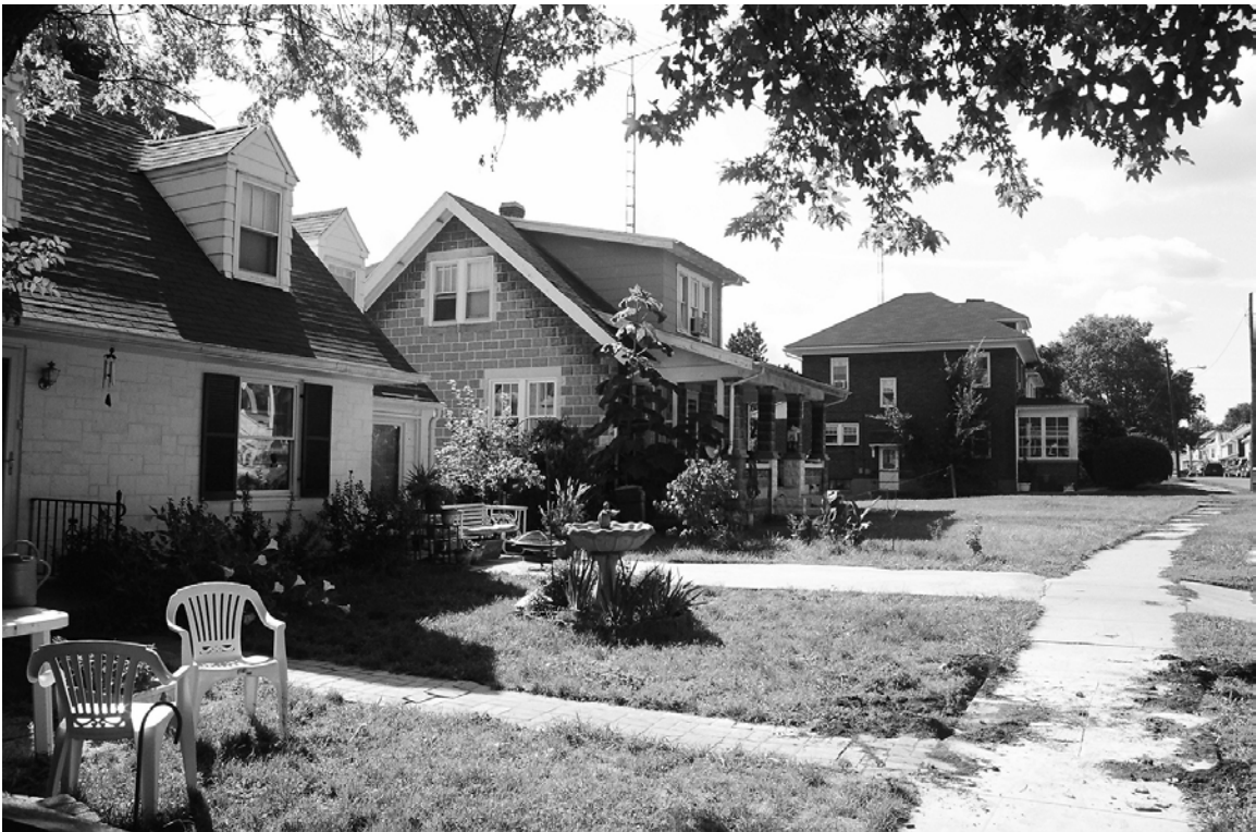
16. Streetscape, east side Boyd Avenue, looking southeast, and showing a Cape Cod-style house at 349, a concrete block Bungalow at 347, and an American Foursquare at 345 Boyd Avenue (Resource No. 47, 48, and 49)