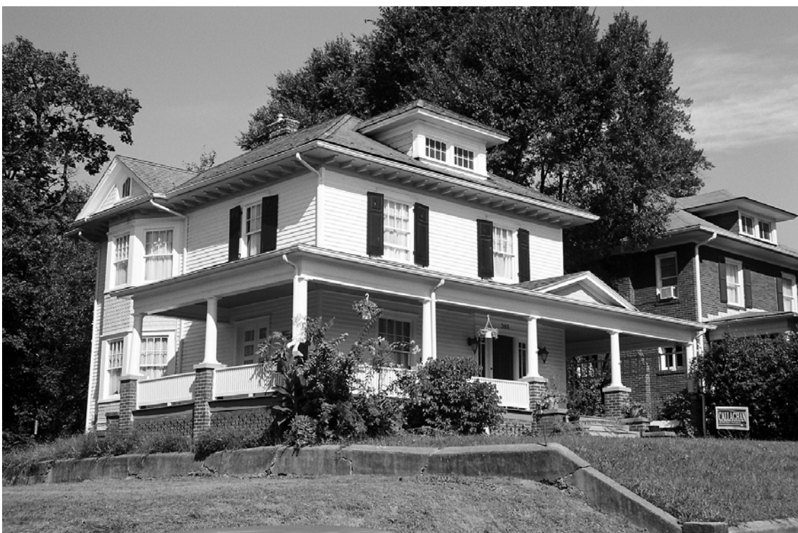
12 366 Boyd Avenue (Resource No. 26), southeast perspective, looking northwest and showing this property and the American Foursquare immediately to the north at 368 Boyd Avenue (Resource No. 27).