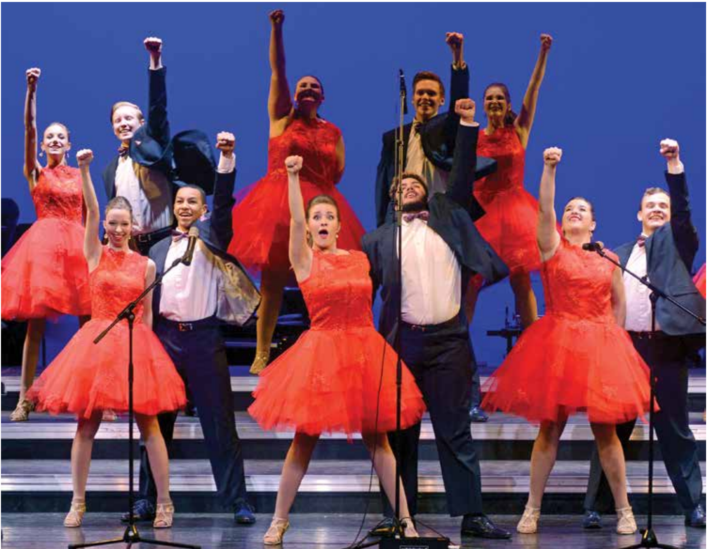
Members of the Capital High School VIPs (Voices in Perfection), an award-winning program created to help in the development of teenagers using choral music, dance and theatre to enhance their talents and build life skills while having fun.

For more than six decades, the Huntington Museum of Art has been