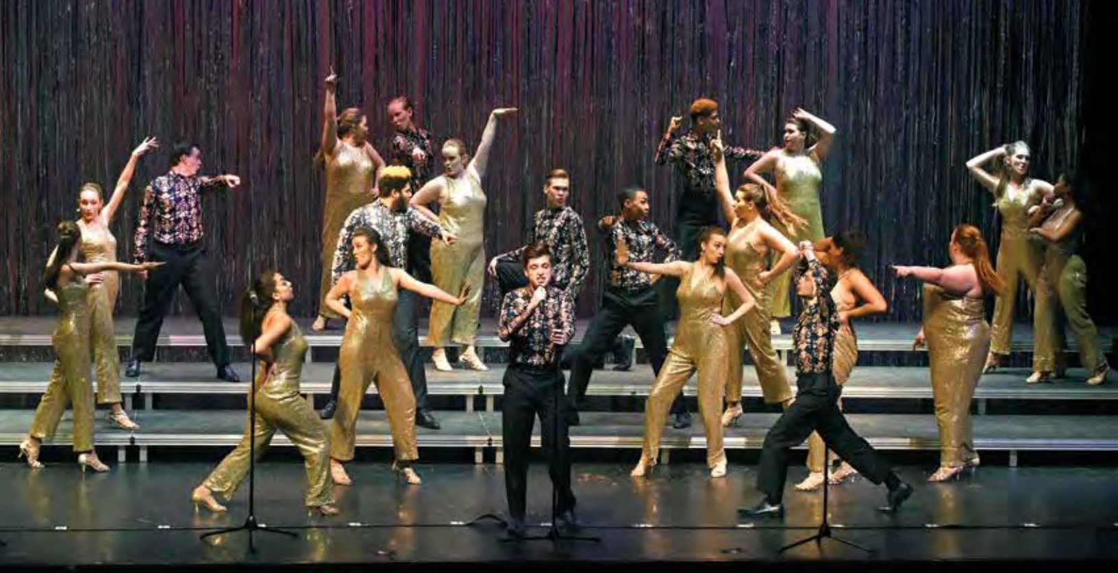
Capital High School's Voice in Perfection show choir performed during a break in the competition.