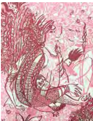
Filiks Pyron, Morgantown, L is for Lovers, Serigraph