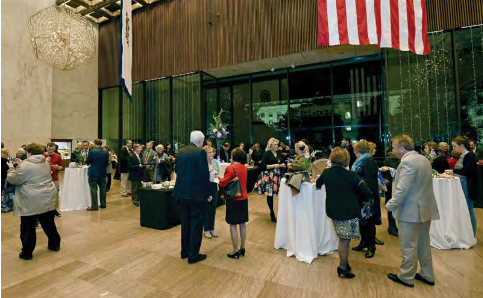
Above: Honorees enjoying the reception.