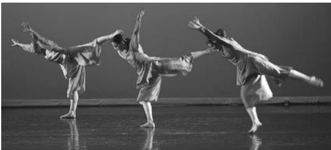
The West Virginia Dance Company performed "Sketches of Fall."