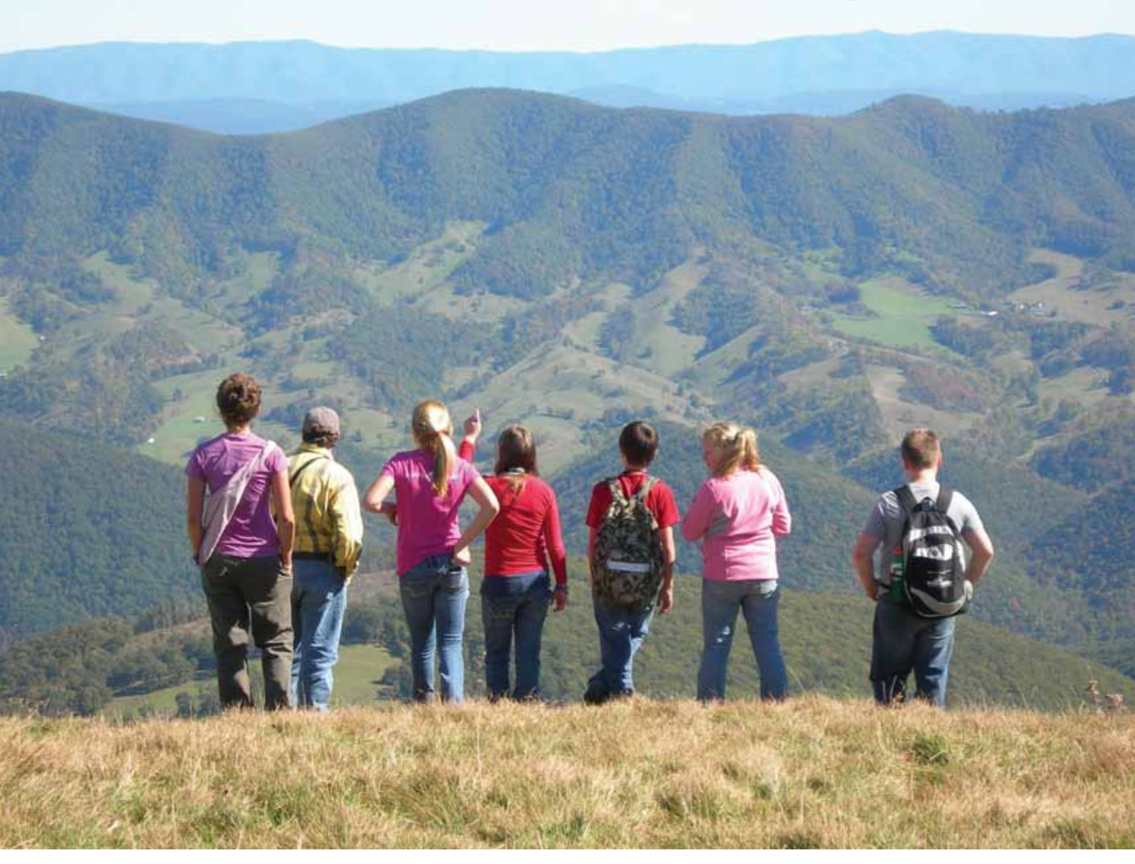
ArtsBanks' special program, The Arts and the Earth , links students with scientists, artists and teachers in an intensive learning experience on Spruce Knob in the Potomac Highlands.