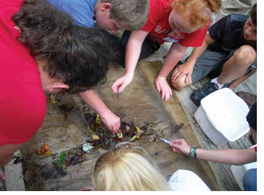
Students learn about the conditions and environment of healthy watersheds during a stream-study exercise.

watersheds, mountain building, karst topography and night skies. Local scientists accompany students exploring the high mountain habitat while ArtsBank teaching artists support the students recording their impressions and images in nature journals.